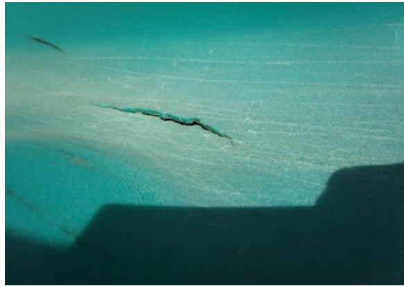
Surfacing - No wear mat at Spiral Slide exit - CLASS C HAZARD