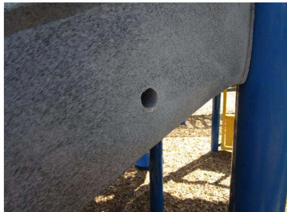
Big Foot Slide - Large crack in center of bed way - MAINTENANCE