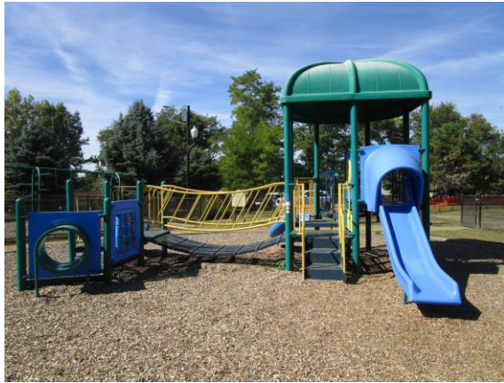
Large Metal Composite Structure