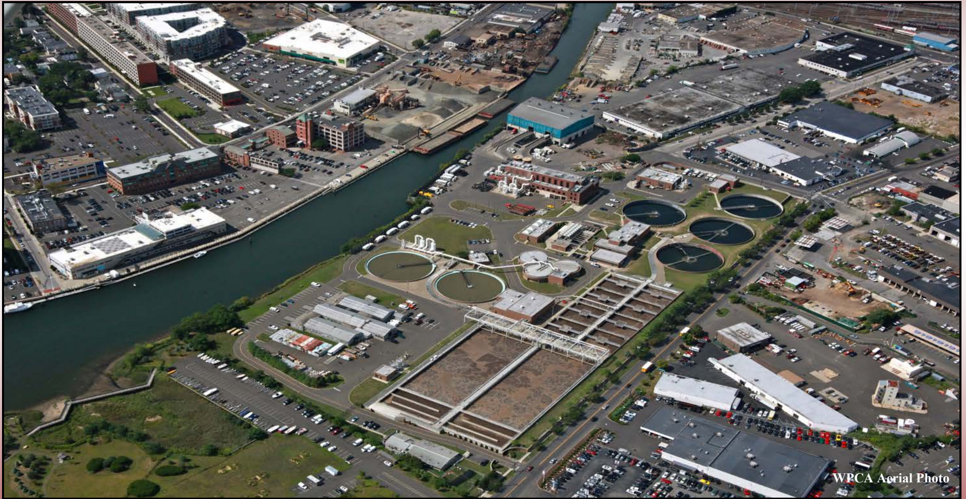
WPCA Aerial Photo