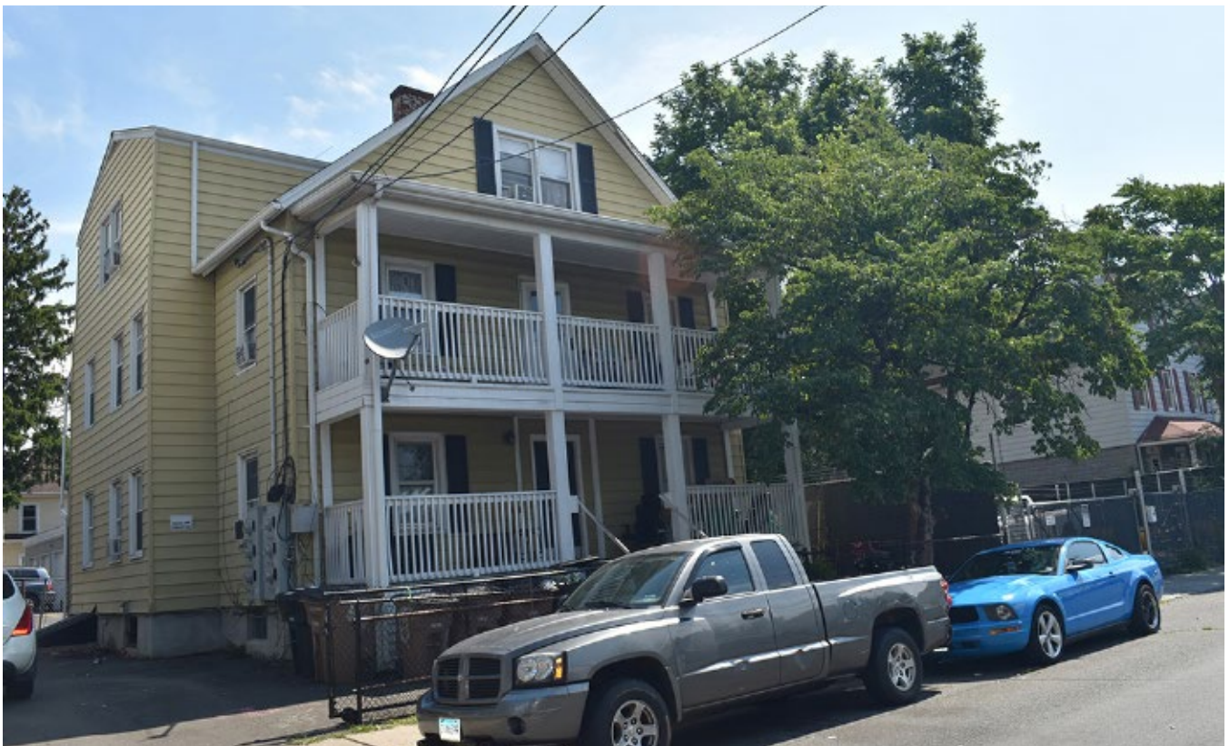
Photograph 55 8 East Walnut Street, view northeast.