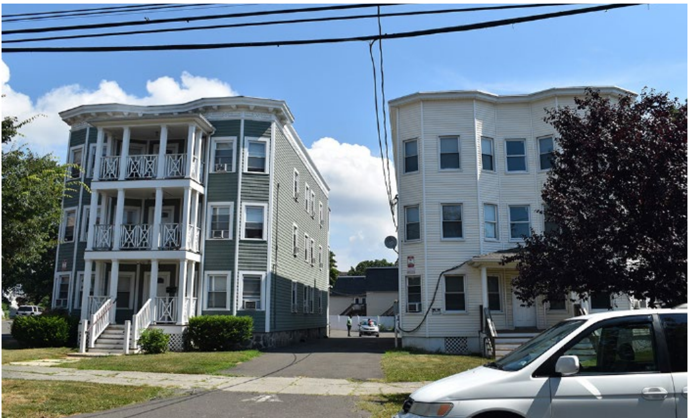
Photograph 45 Three-story tenements, northern side of Woodland Place, view north.