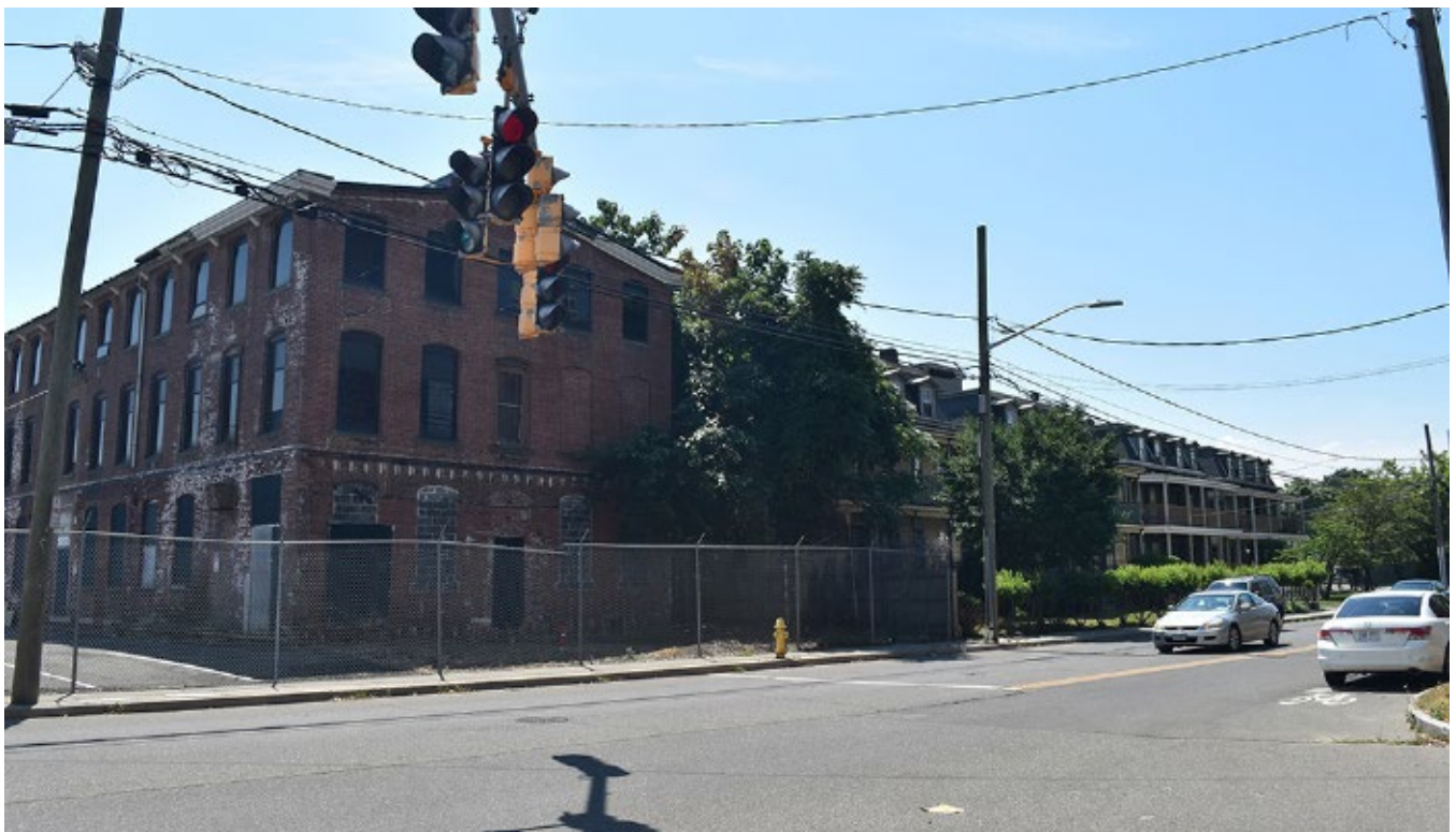
Photograph 25 The Blickensderfer Typewriter Factory (left) and Second Empire multi-family housing (right) as seen from Atlantic Street, view southeast.