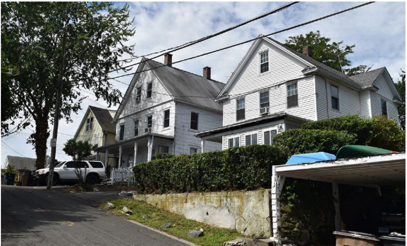
Photograph 43 Streetscape, northwestern side of Lipton Place (number 13-15), view southwest.