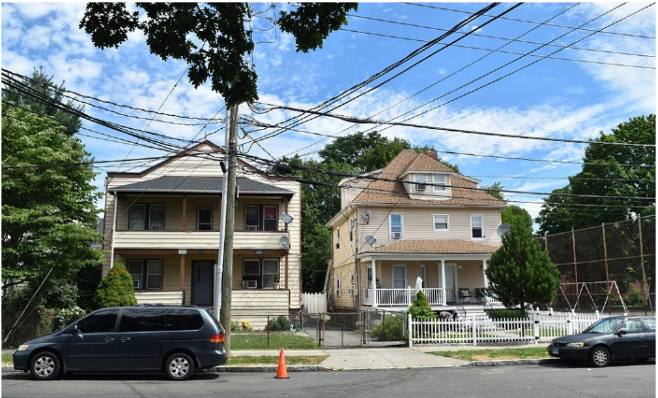
Photograph 41 Multi-family housing, north side of Woodland Avenue, view north.