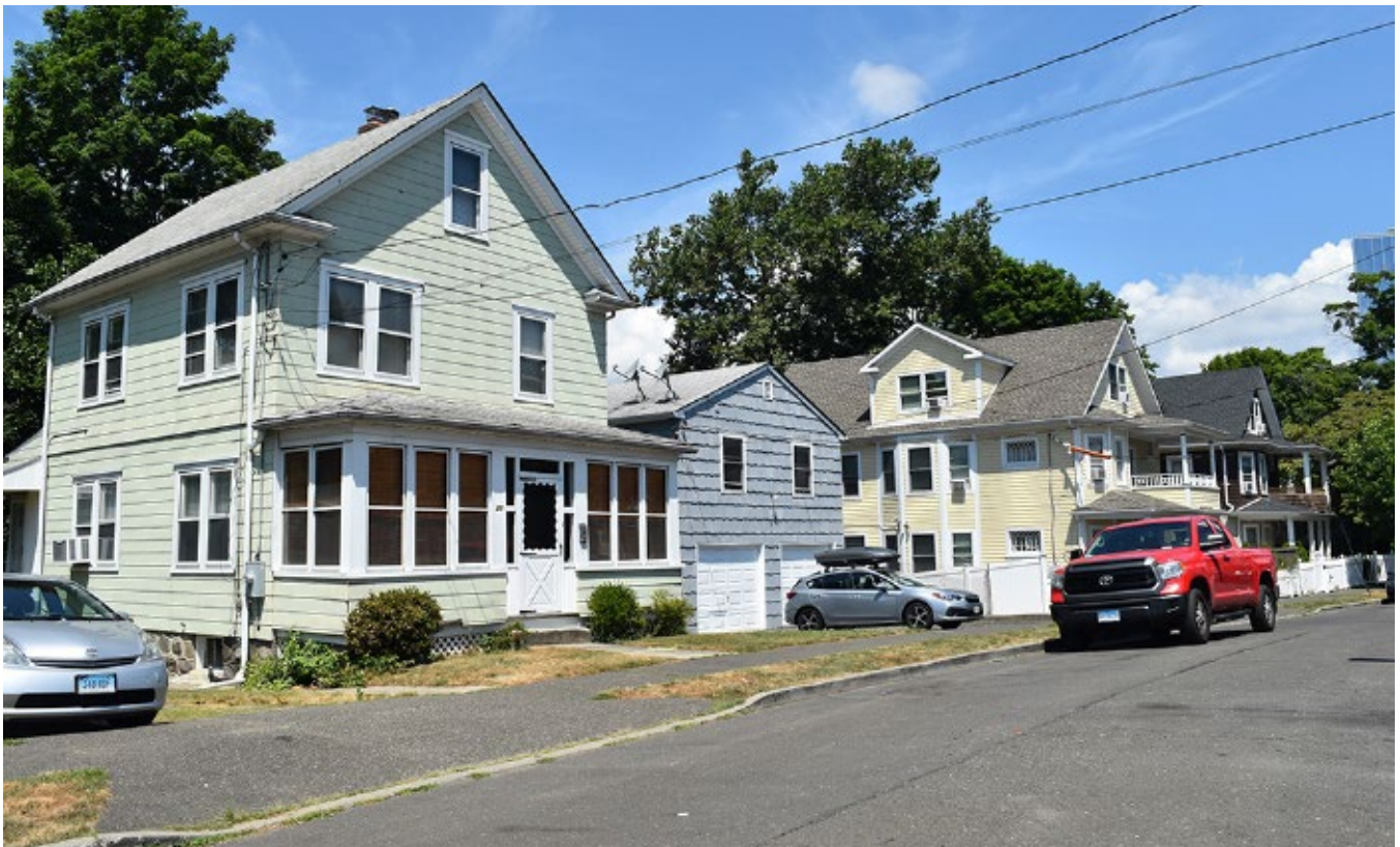
Photograph 31 Streetscape, multifamily houses on the western side of Berkeley Street, view northwest.