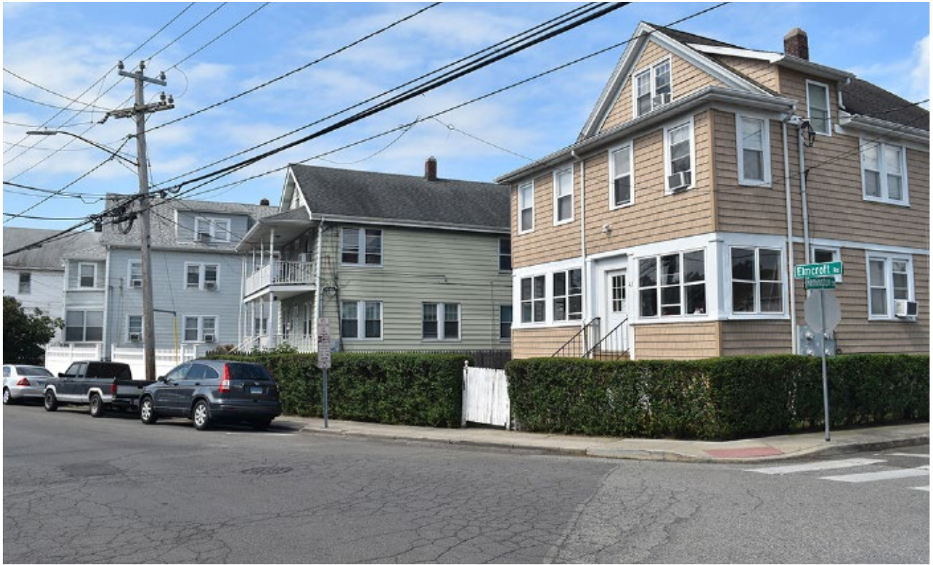
Photograph 64 Streetscape, western side of Elmcroft Road (numbers 41-53), view southwest.