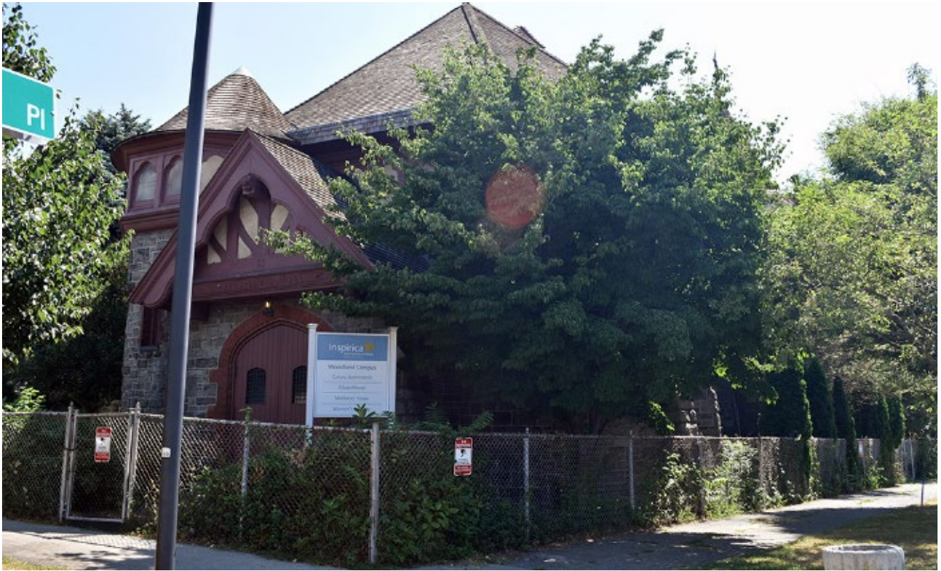
Photograph 3 The Parish of St. John's Church, 712 Pacific Street.