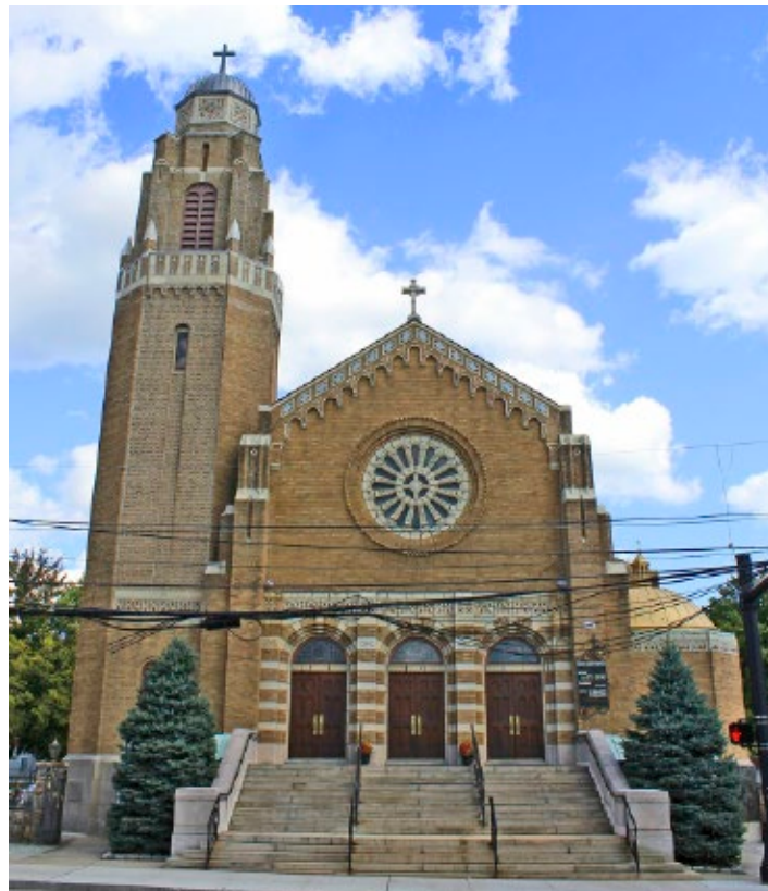
Photograph 6 Church of the Holy Name of Jesus, 305 Washington Boulevard.