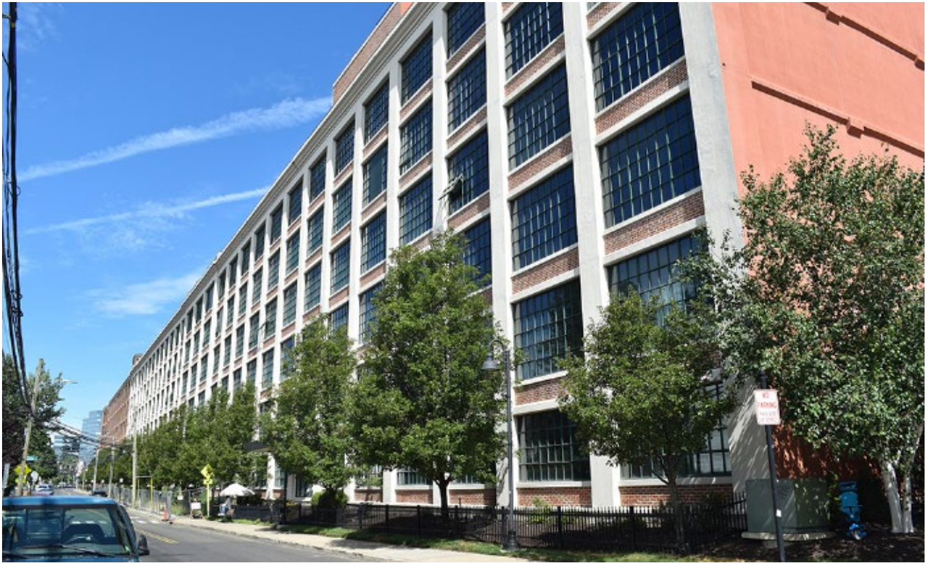
Photograph 8 Yale and Towne factory, view west.