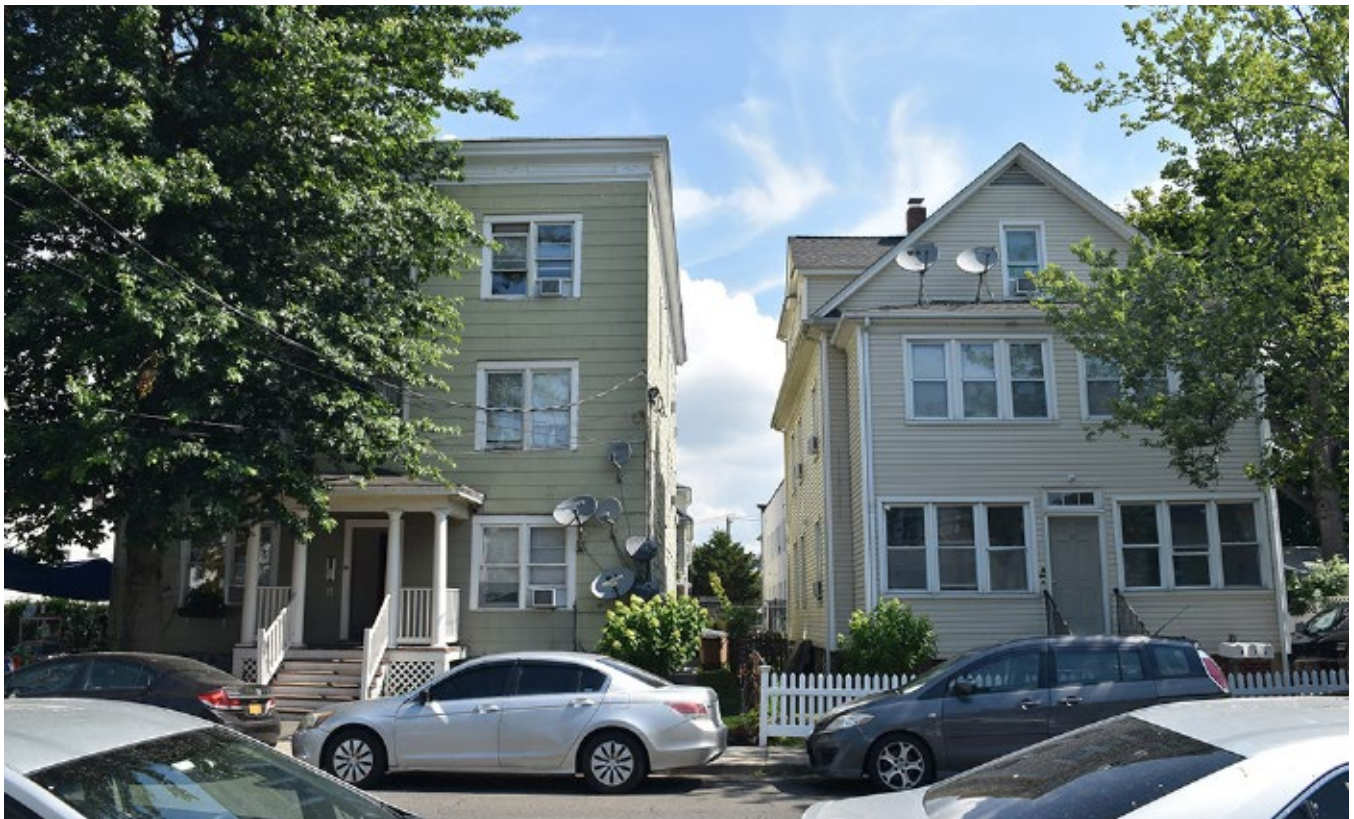
Photograph 59 Multi-family houses, East Walnut Street, view northeast.