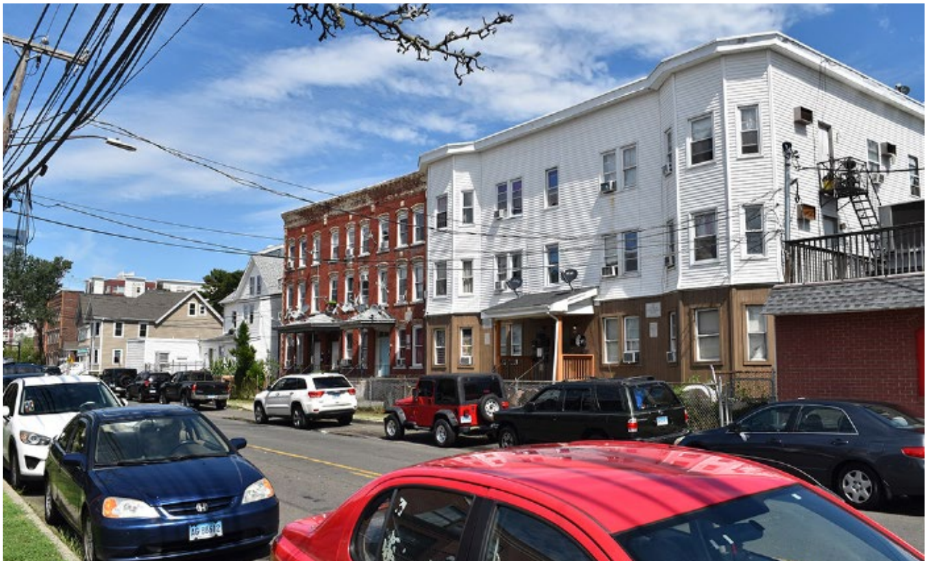
Photograph 29 Streetscape, three-story tenements on the northside of Henry Street (numbers 134-146) to the east of Garden Street, view northwest.