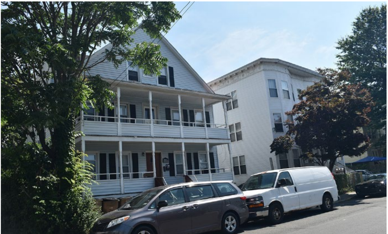
Photograph 57 Tenement housing on East Walnut Street, view northeast.