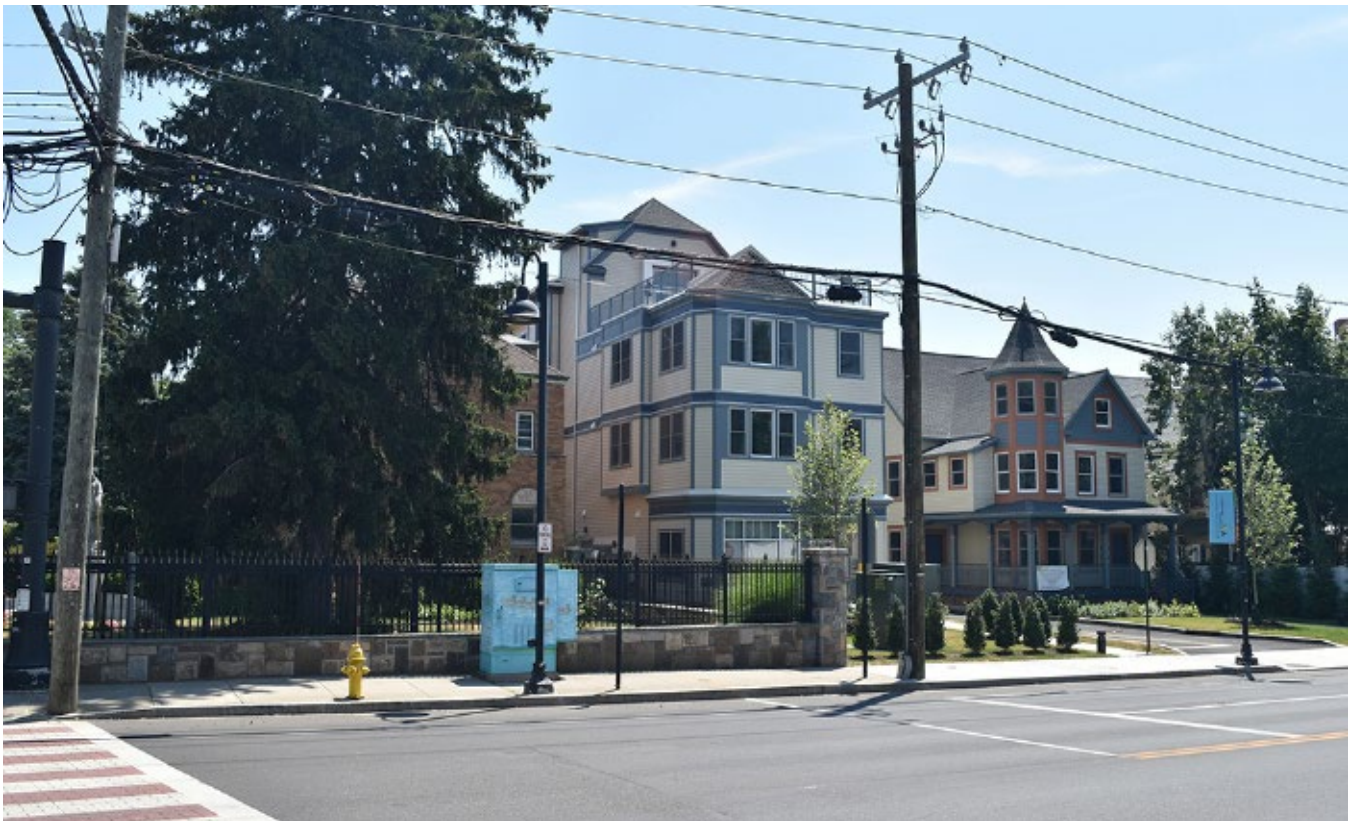
Photograph 35 Washington Boulevard (numbers 305-287), view east.