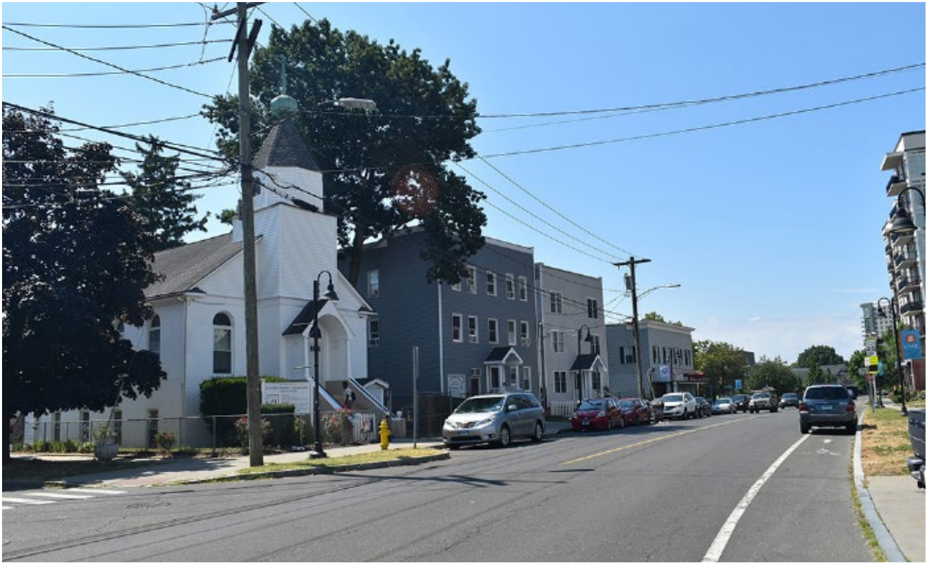
Photograph 5 Greater Works Community Church of God (far left), 724 Pacific Street.