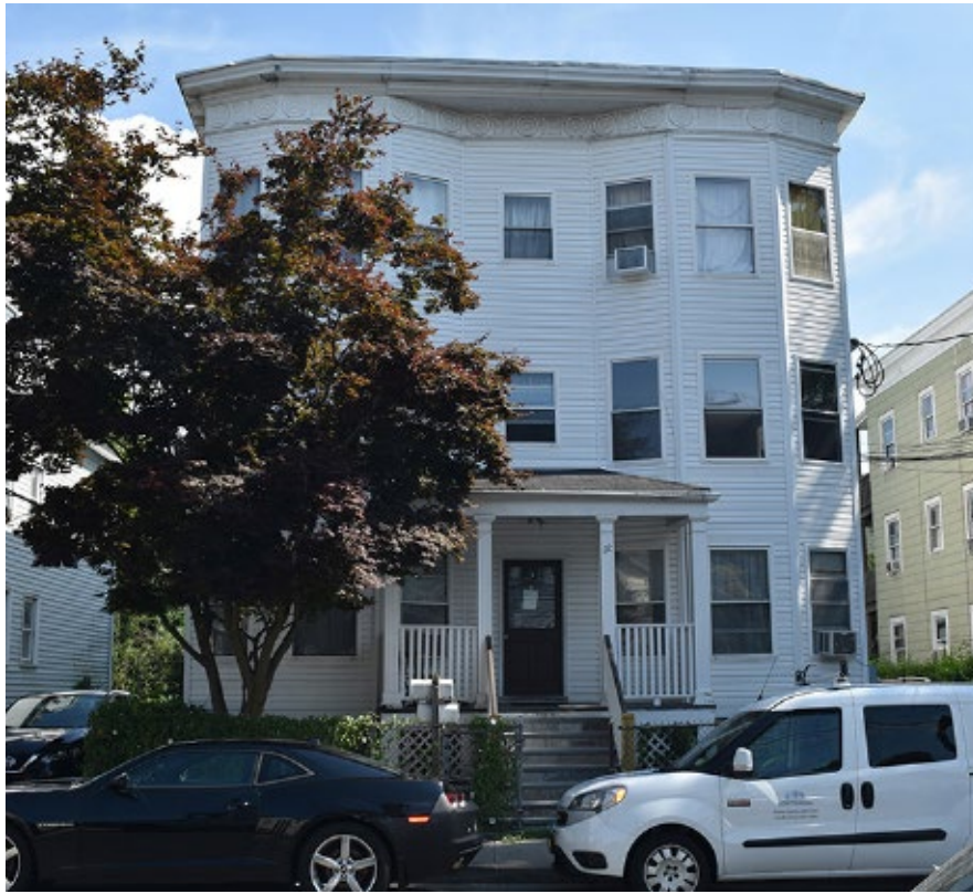
Photograph 58 Three-story tenement, East Walnut Street, view northeast.