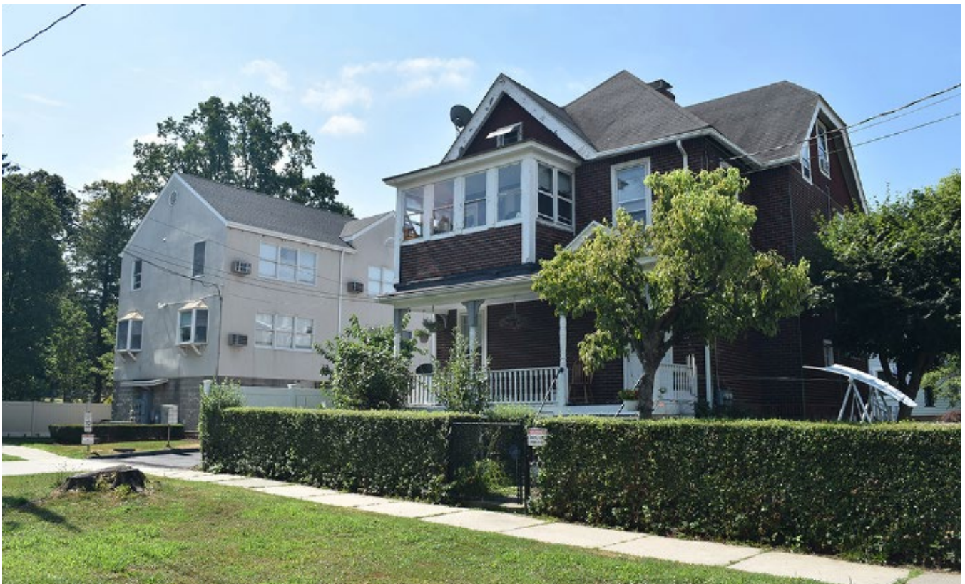
Photograph 51 Muti-family house on the corner of Woodland Place and Elmcroft Road, view south.