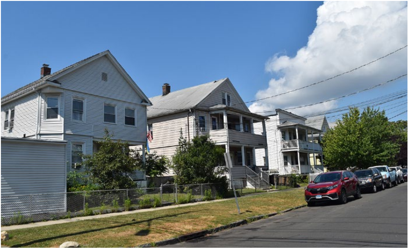
Photograph 50 Multi-family houses on the southern side of Woodland Place, view southwest.