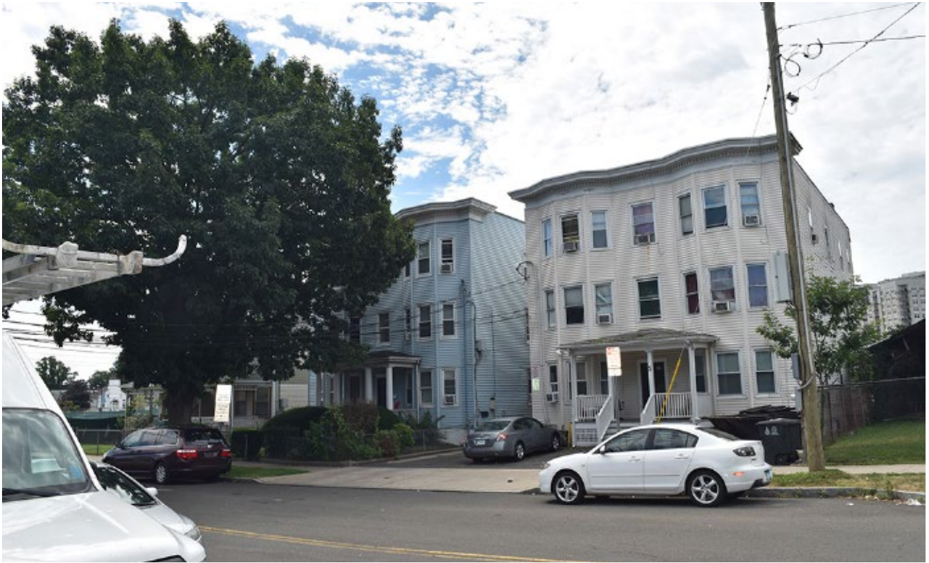
Photograph 40 Three-story tenements on Woodland Avenue, view south.