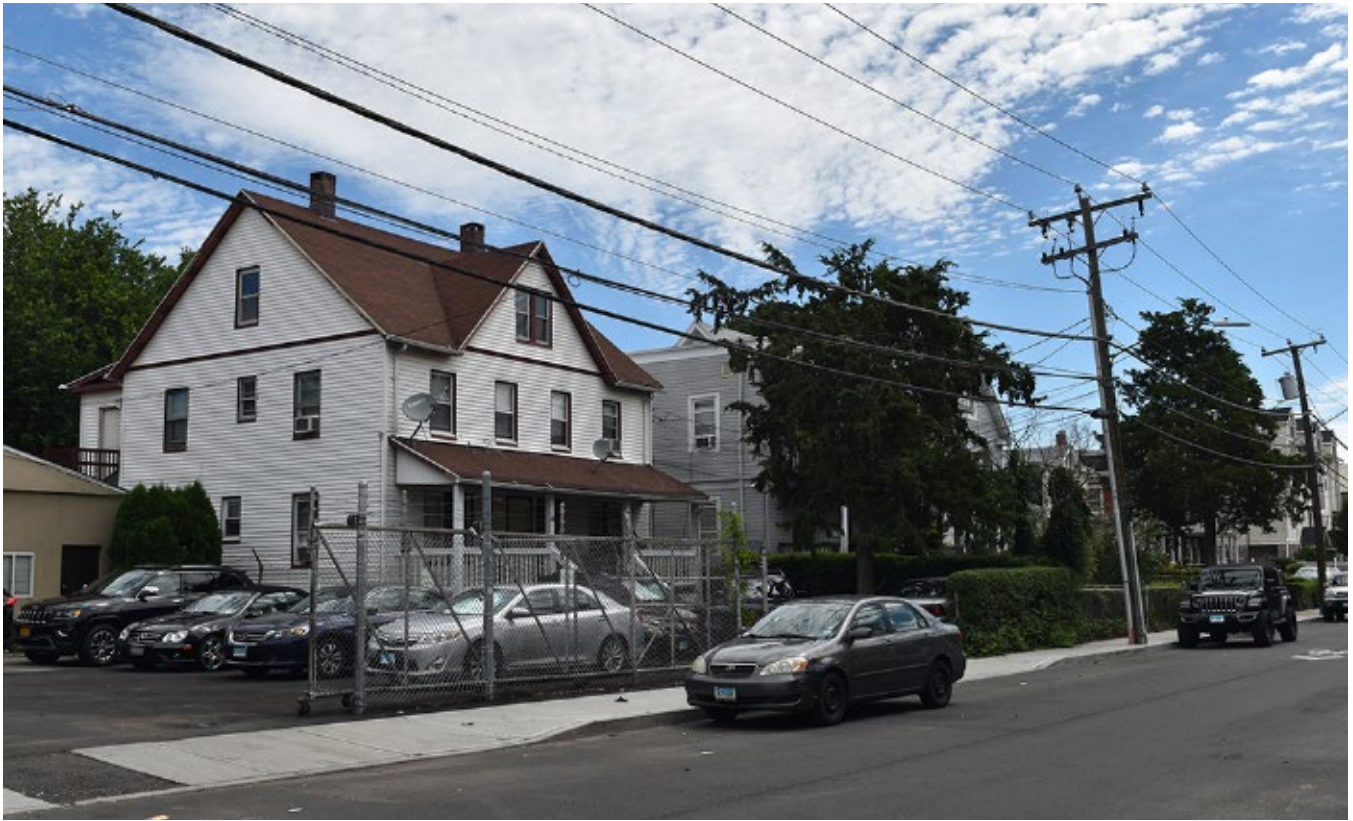
Photograph 10 36 Ludlow Street, view east.