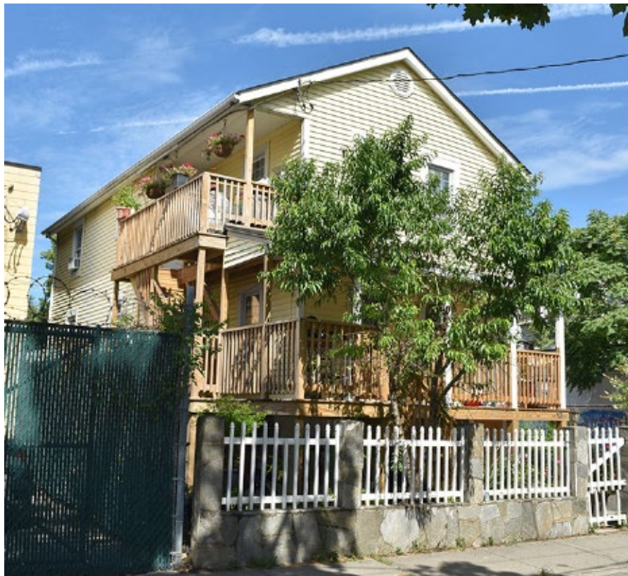
Photograph 21 House, 43 Cedar Street, situated on the west side of the street, view west.