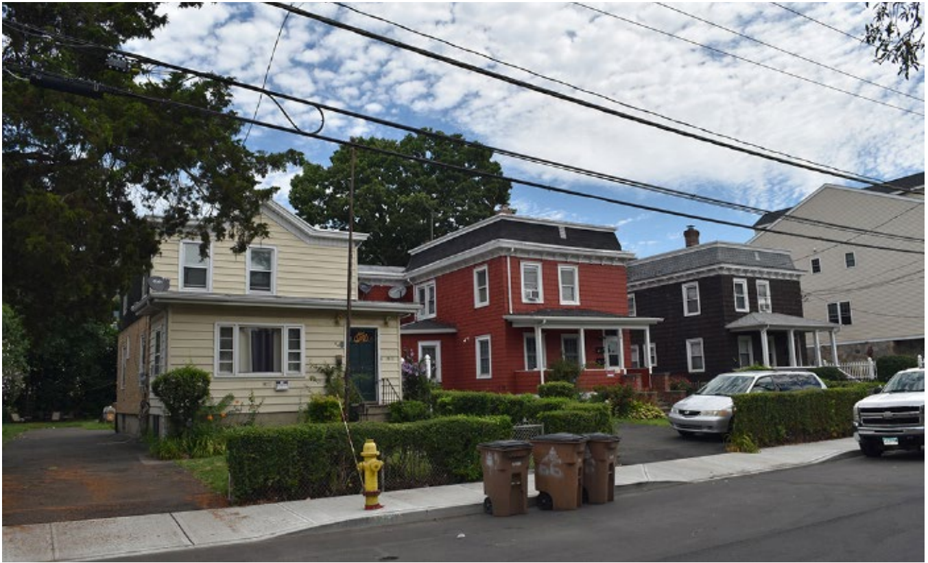
Photograph 12 North side of Ludlow Street (numbers 66-82) showing late 19th century middle-class housing, view east.