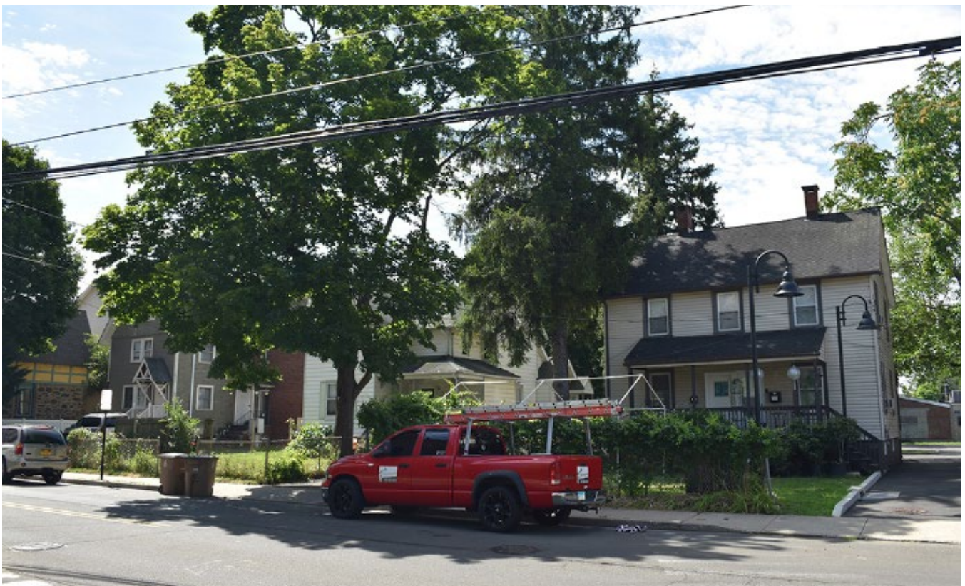
Photograph 9 171-181 Henry Street, view southwest.