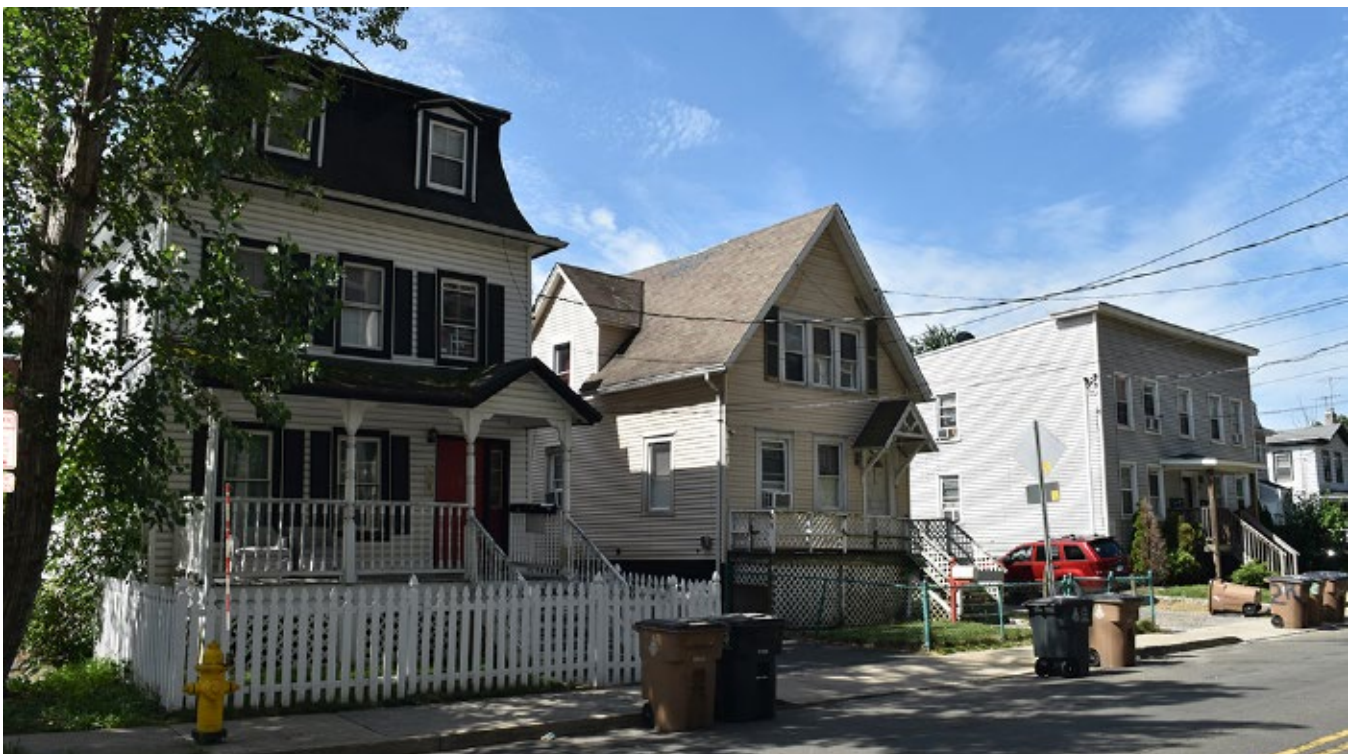
Photograph 17 Streetscape, south side of Henry Street (numbers 213-207), directly across from the Yale and Towne Factory. Instances of both multi-family and middle-class housing still present, view southwest.