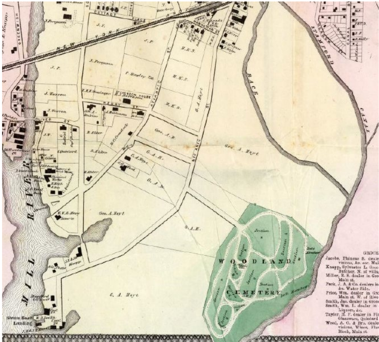
Figure 3 Detail view of the South End from the 1867 Beers Map of Stamford. The area was still primarily residential, although more industry had been established in the northern corner and to the southwest, between Oliver and Atlantic Streets.

manufactured by waterpower were progressively replaced by steam power operations. Within 50 years of the Civil War, Stamford became a manufacturing city with a diversified population.