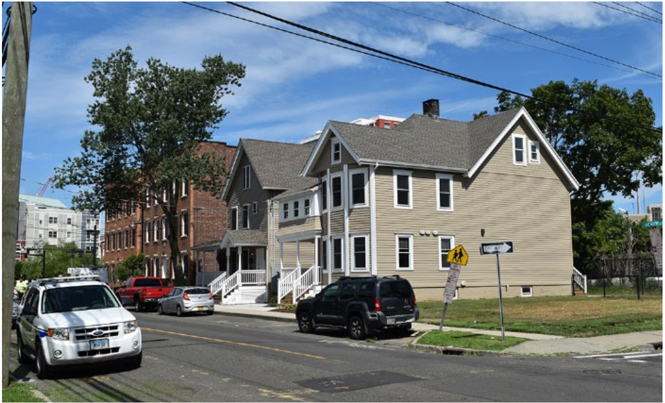
Photograph 28 Streetscape, north side of Henry Street (numbers 130-118), view northwest.