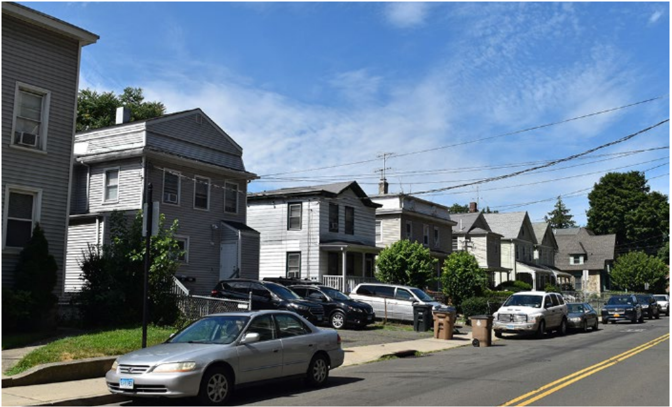
Photograph 16 Streetscape, south side of Henry Street (numbers 207-185), directly across from the Yale and Towne Factory. Instances of both multi-family and Italianate and Second Empire-style middle class housing still present, view west.