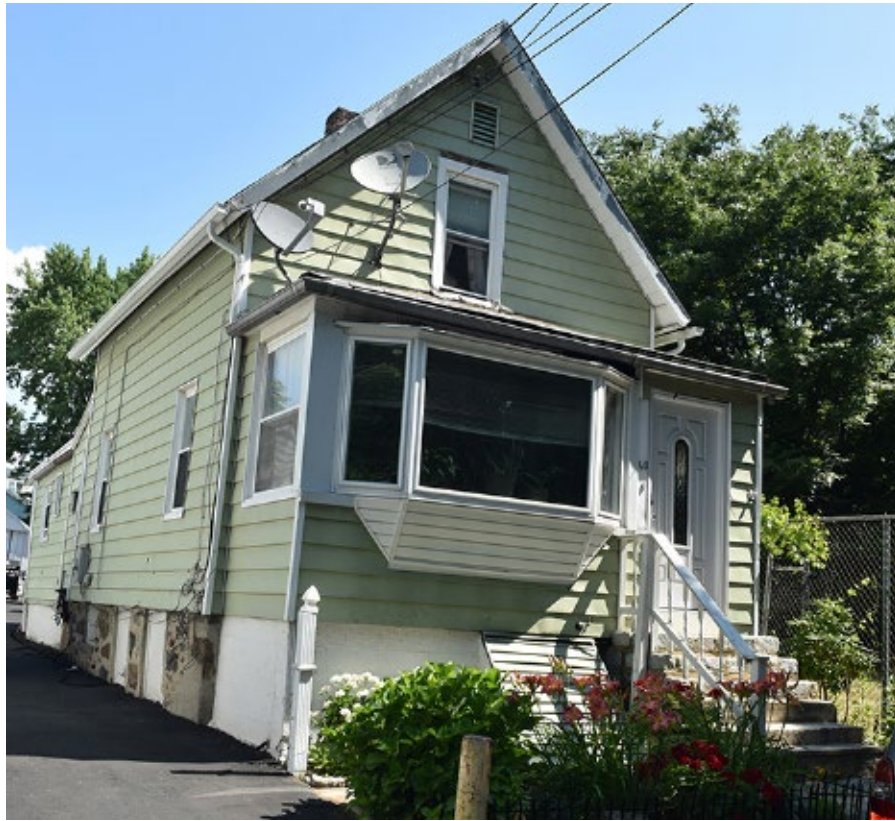
Photograph 24 Detail view of a vernacular cottage on Stone Street (number 70), view north.