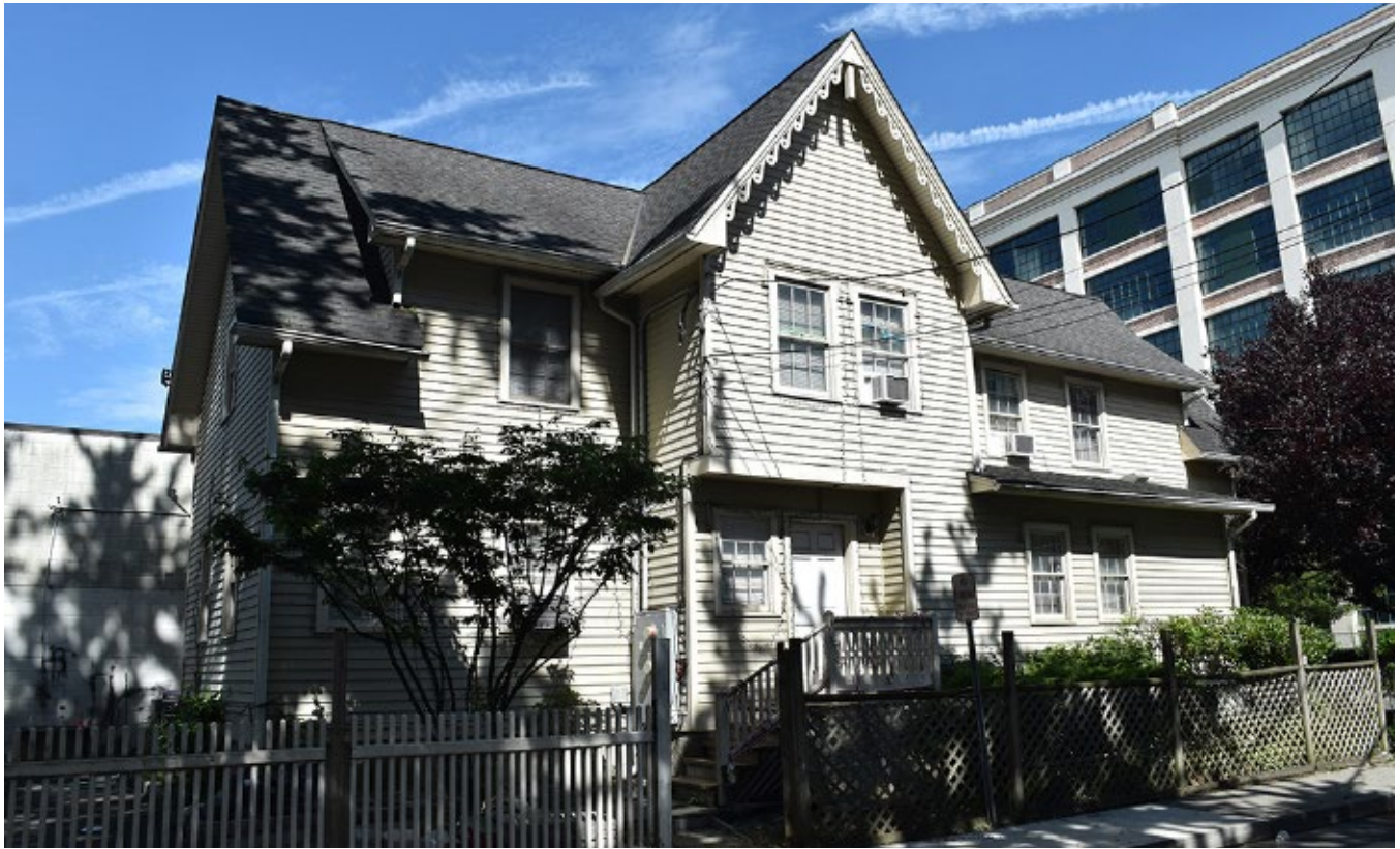
Photograph 18 Victorian Gothic-style house, 223 Henry Street. The Yale and Towne Factory is viewable to the right,