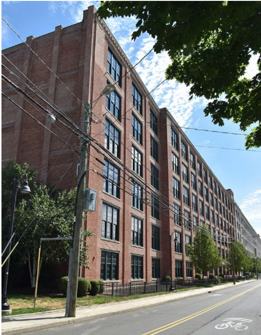
Photograph 7 Yale and Towne factory, view east.