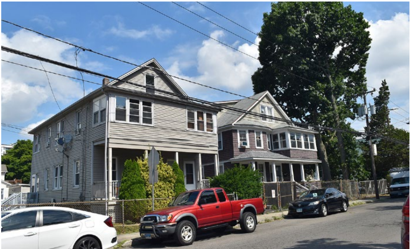
Photograph 63 Streetscape, western side of Elmcroft Road (numbers 31-29), view northwest).