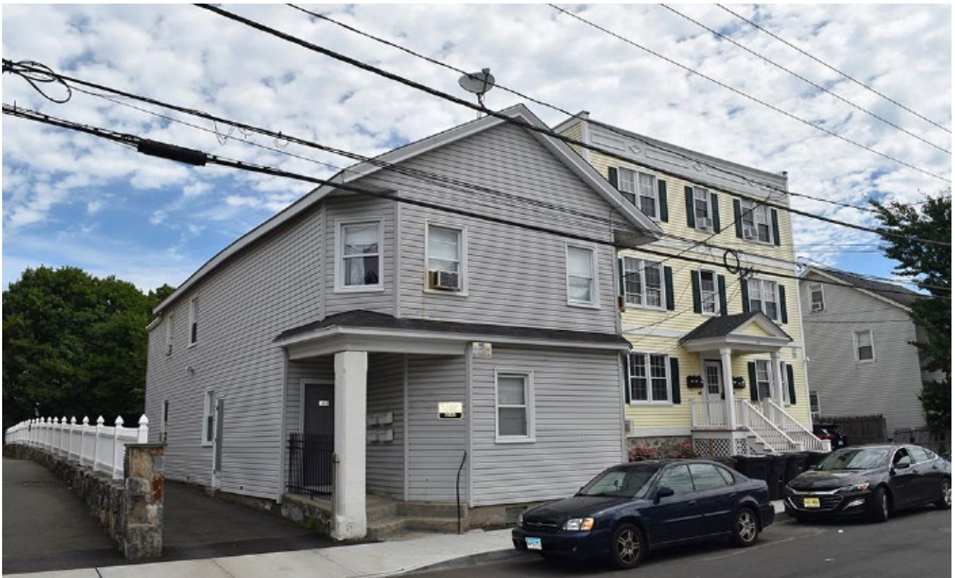
Photograph 13 North side of Ludlow Street (numbers 108-114) showing an early 20th century vernacular building and a three-story tenement, view east.