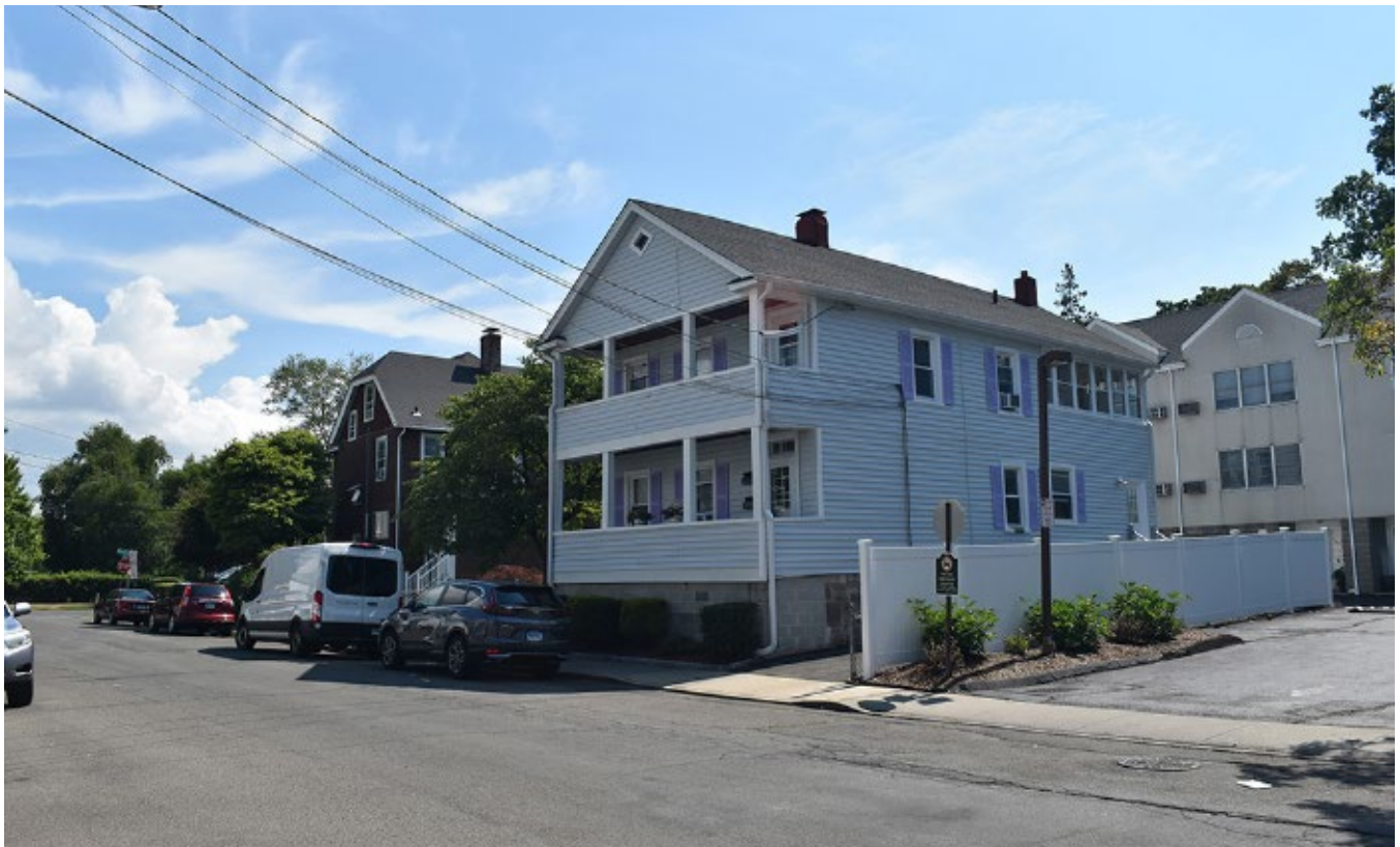
Photograph 61 8 Elmcroft Road, view northeast.