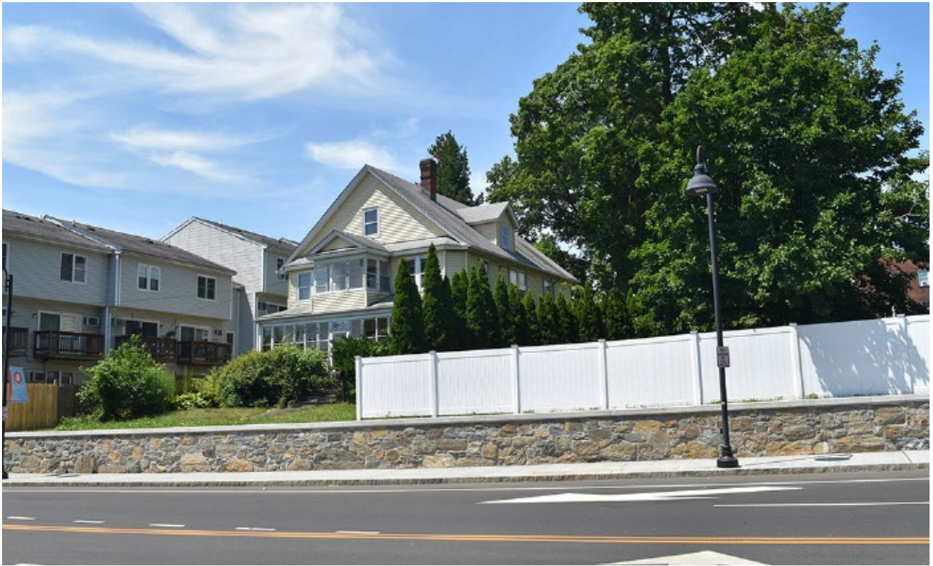
Photograph 34 274 Washington Boulevard, view west.