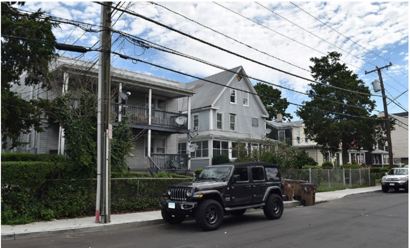
Photograph 11 North side of Ludlow Street (numbers 40-66), view east.