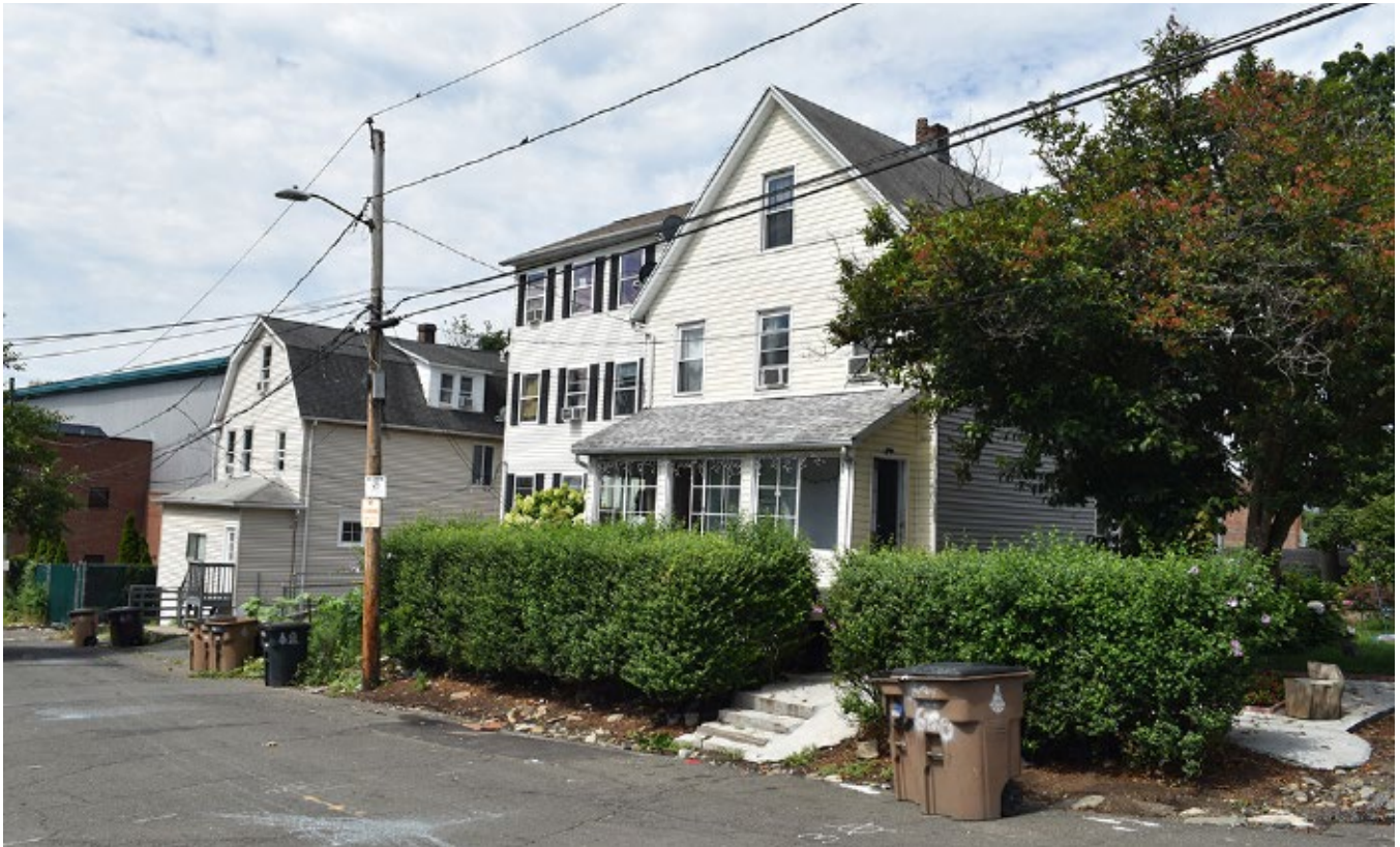
Photograph 42 Streetscape, northwestern side of Lipton Place (number 6-10), view west.