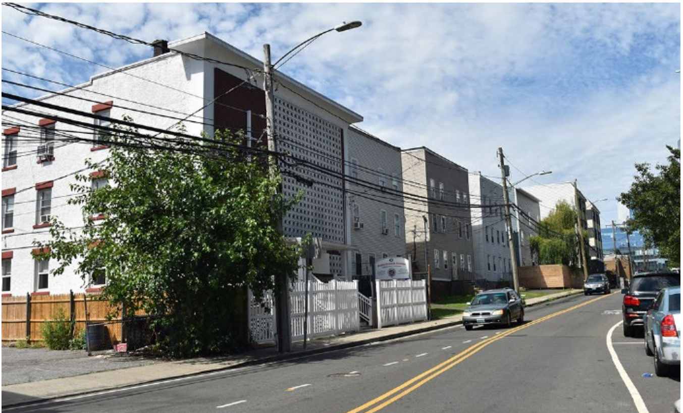
Photograph 4 First Spanish Church of the Nazarene (far left), 89 Henry Street.