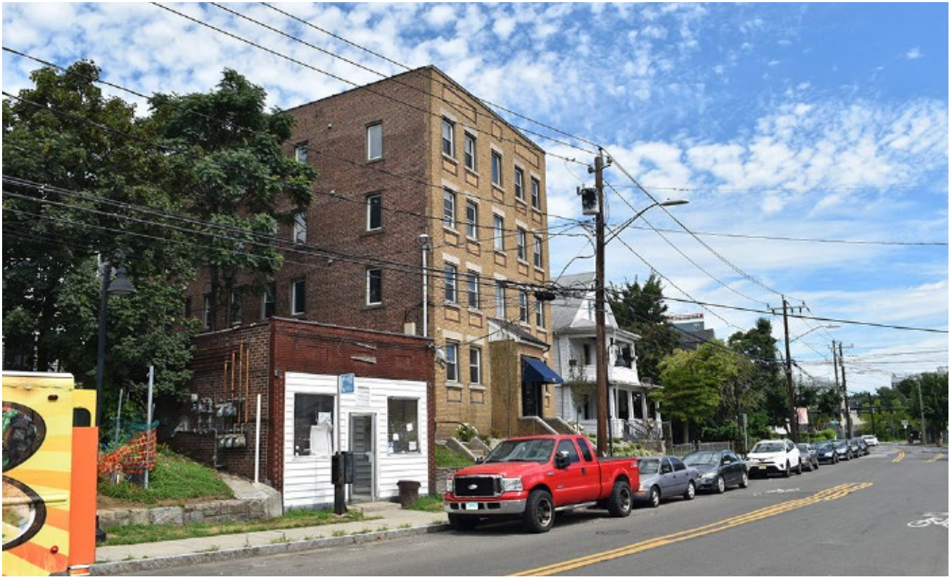
Photograph 38 Streetscape, west side of Atlantic Street (numbers 779-759), view northwest.