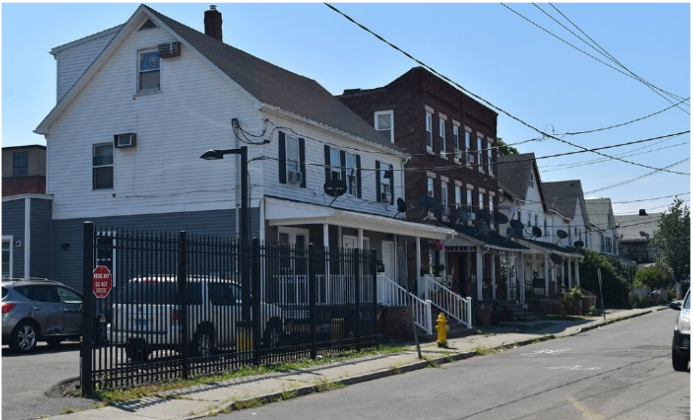
Photograph 27 Streetscape, east side of Garden Street, view south.