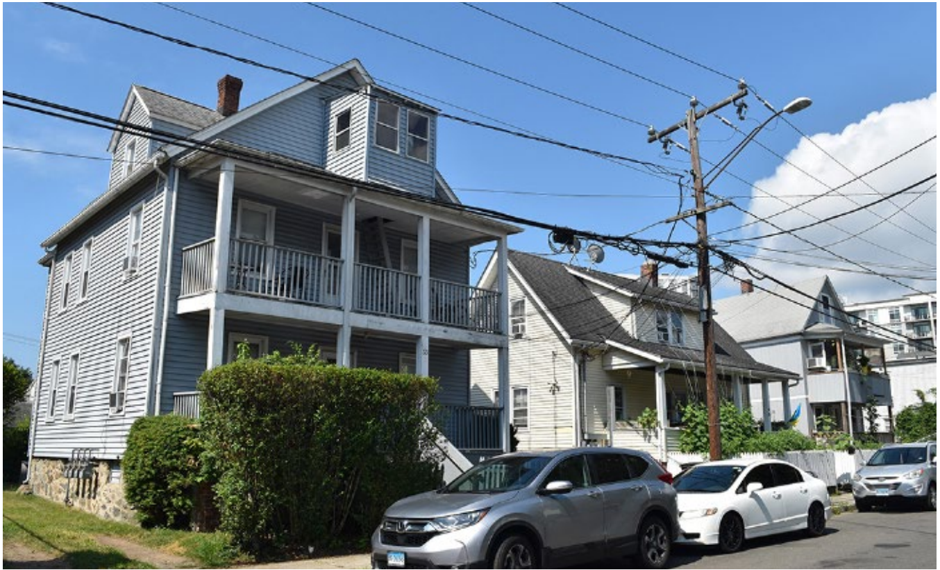
Photograph 60 Streetscape, southside of East Walnut Street, view southwest.