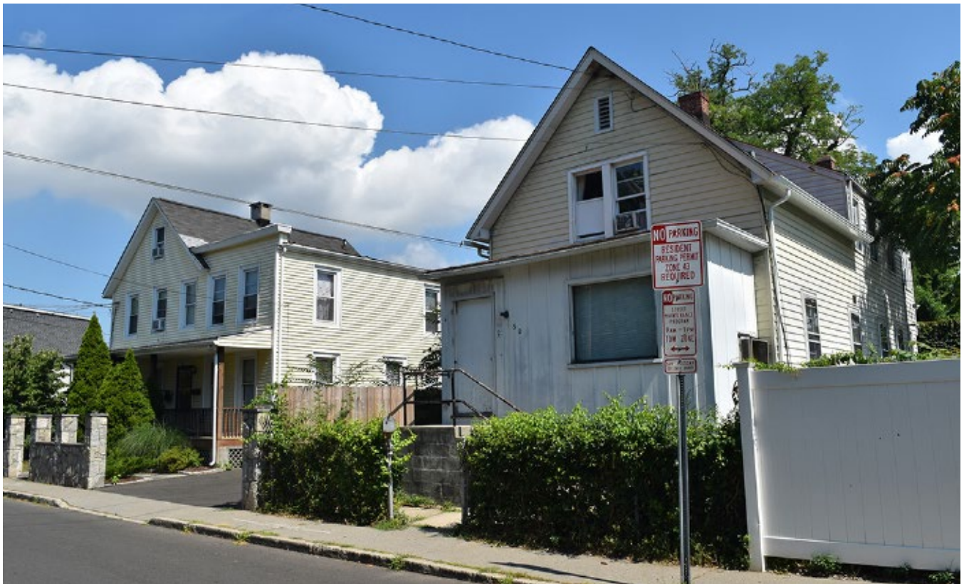
Photograph 22 Northern side of Stone Street, to the west of Cedar Street, view northwest.