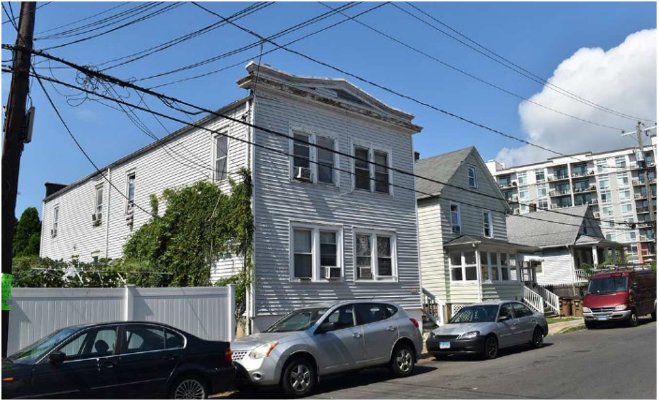
Photograph 56 Streetscape, southside of East Walnut Street (numbers 21-13), north-