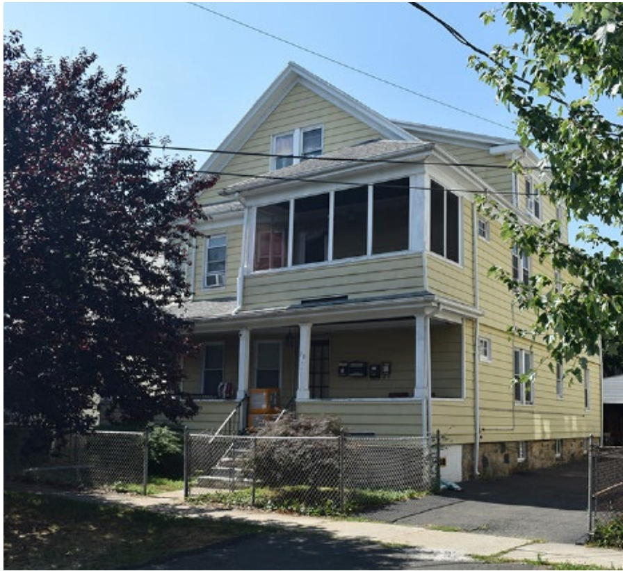
Photograph 48 Multi-family house, 29 Woodland Place, view southwest.