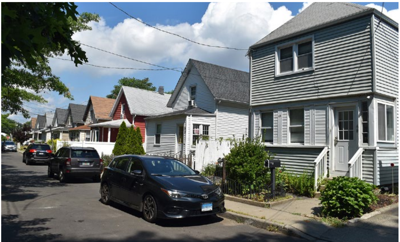
Photograph 23 Streetscape, vernacular one-and-one-half story vernacular cottages on the northside of Stone Street, view northwest.