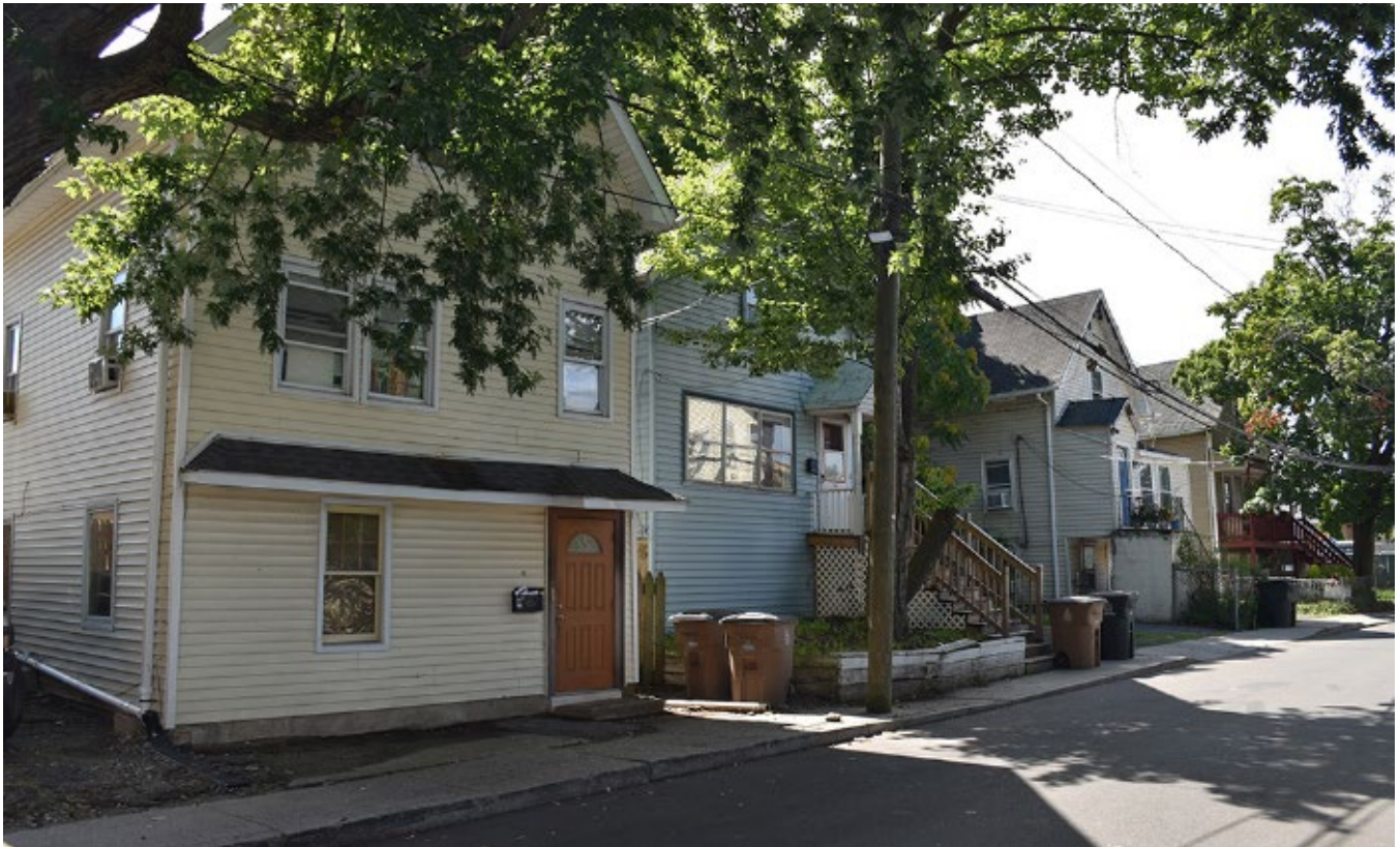
Photograph 20 Streetscape, east side of Cedar Street, view southeast.