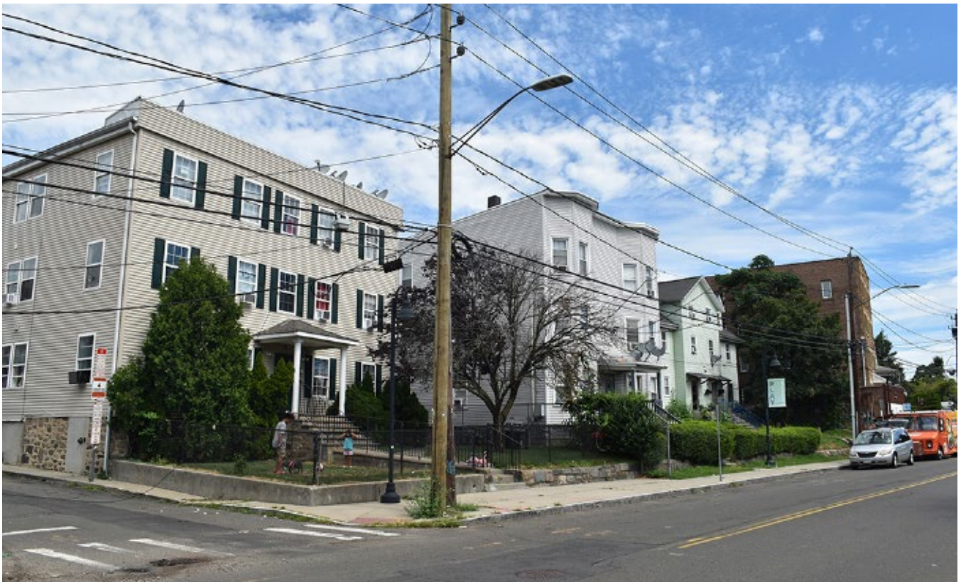
Photograph 39 Streetscape, west side of Atlantic Street (numbers 791-773) showing three-story tenements, view northwest.