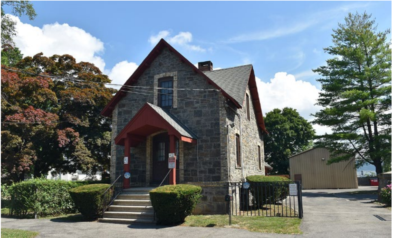
Photograph 52 Cemetery Cottage, view northeast.