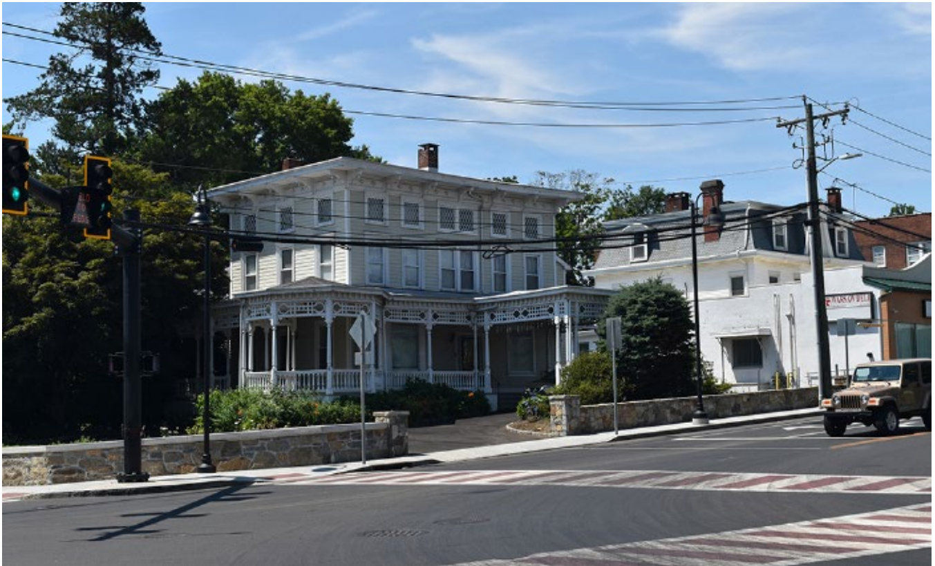
Photograph 44 Duncan Phyfe House, 4 Pulaski Street, view southwest.