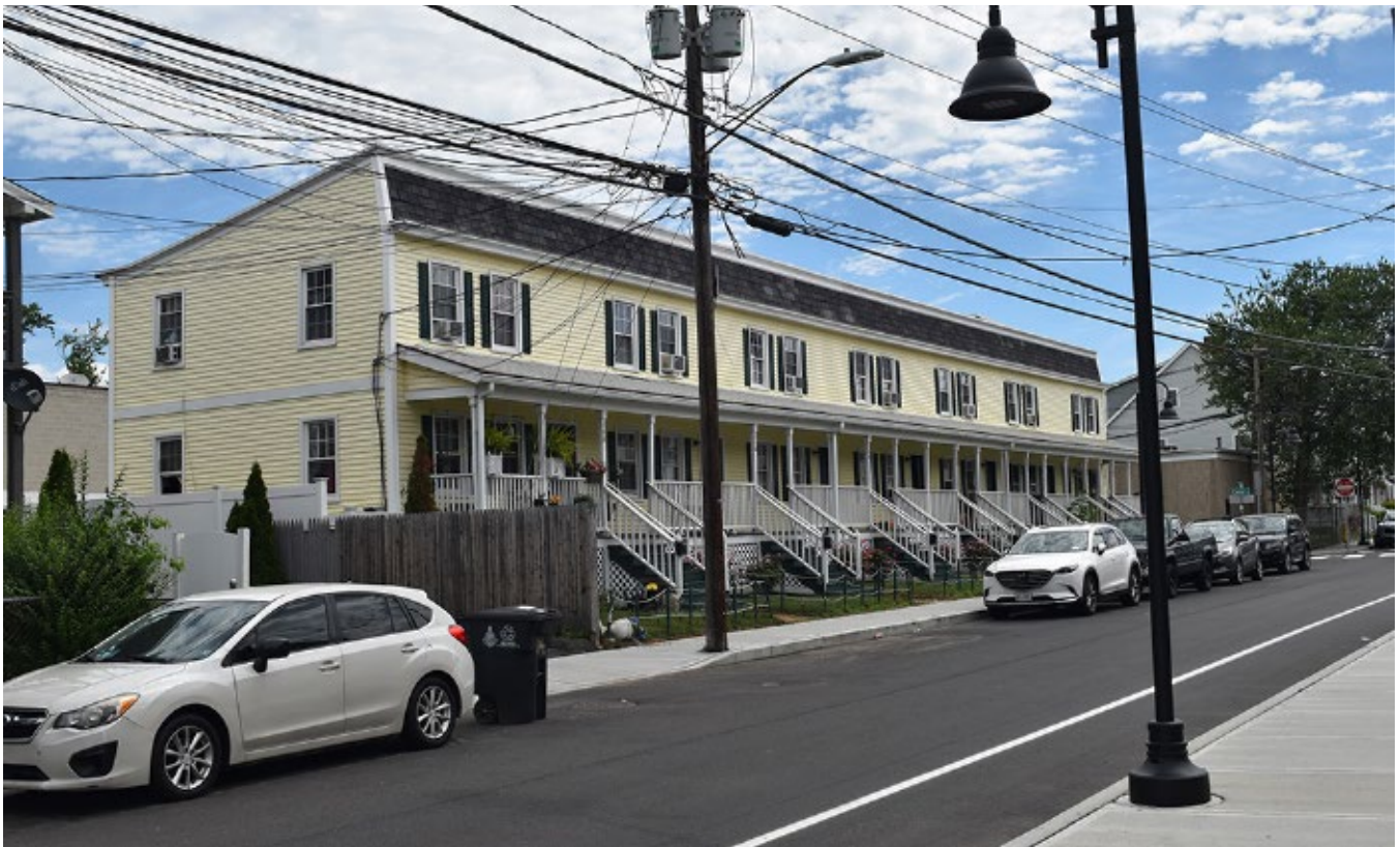
Photograph 15 Row houses (number 142) situated on the north side of Ludlow Street, view east.