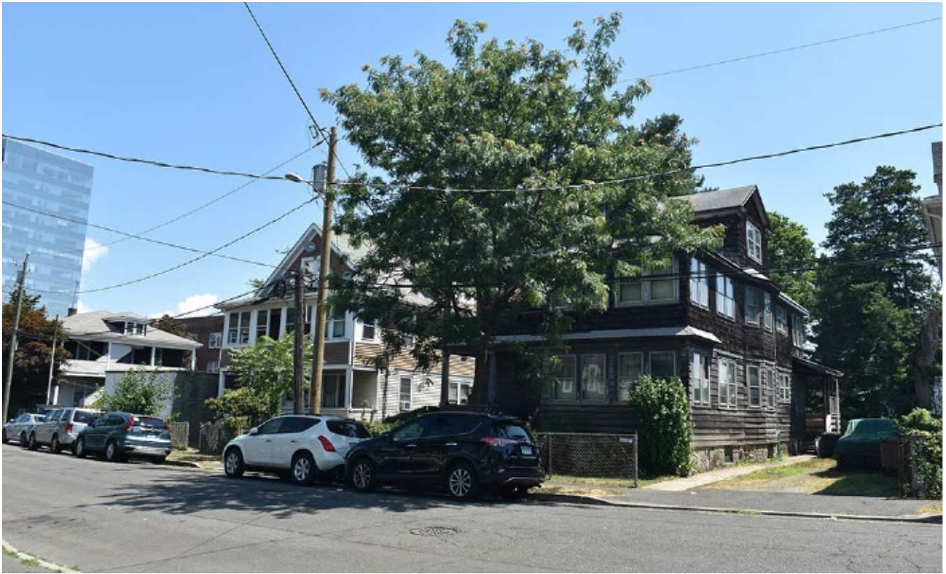
Photograph 30 Streetscape, multifamily housing on the eastern side of Berkeley Street (numbers 16-10), view northeast.