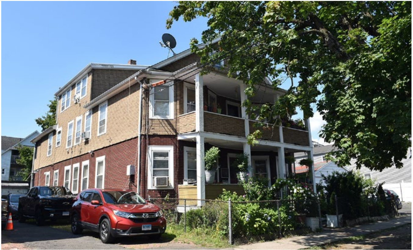
Photograph 46 Multi-family house, southern side of Woodland Place, view southwest.