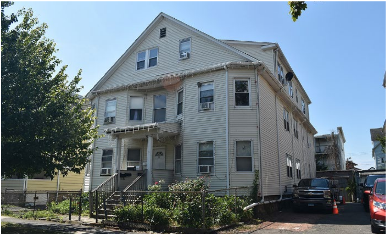
Photograph 47 Multi-family house, 25 Woodland Place, view southwest.