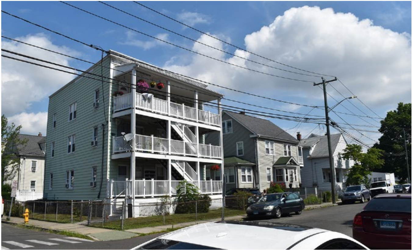
Photograph 62 Streetscape, western side of Elmcroft Road (numbers 11-9 and 41 Woodland Avenue, view northwest).