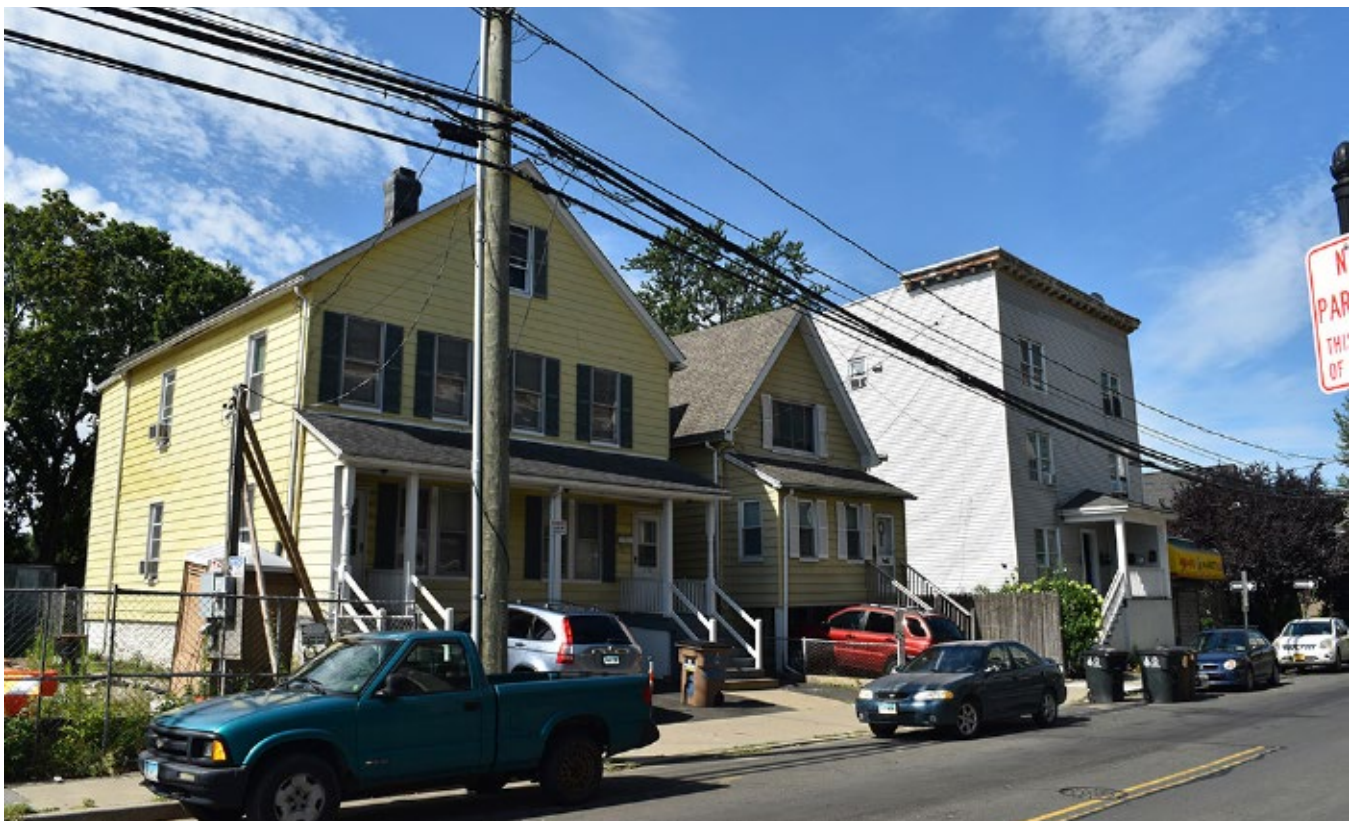
Photograph 19 Streetscape, south side of Henry Street (number 233-227), view southeast.