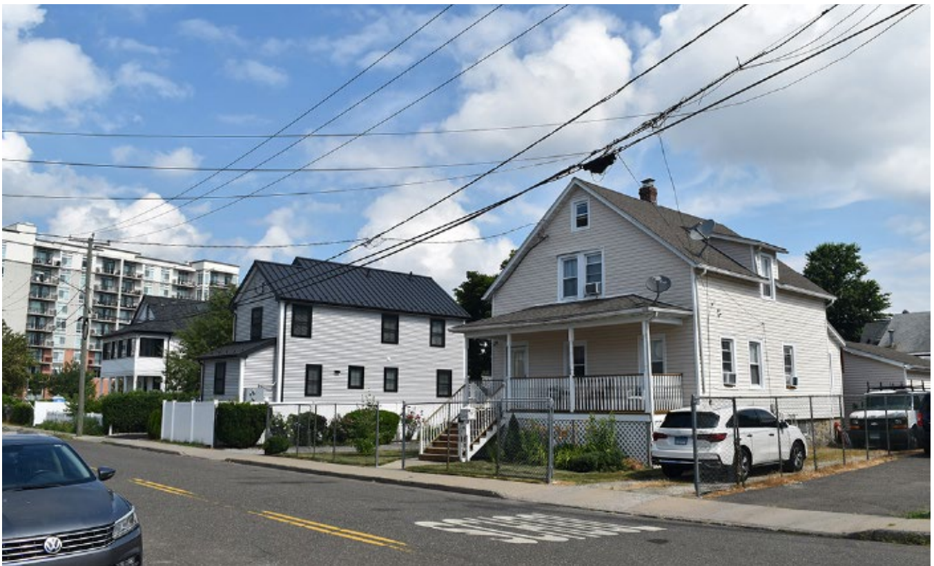
Photograph 53 Streetscape, northside of Remington Street (numbers 20-30), view northwest.