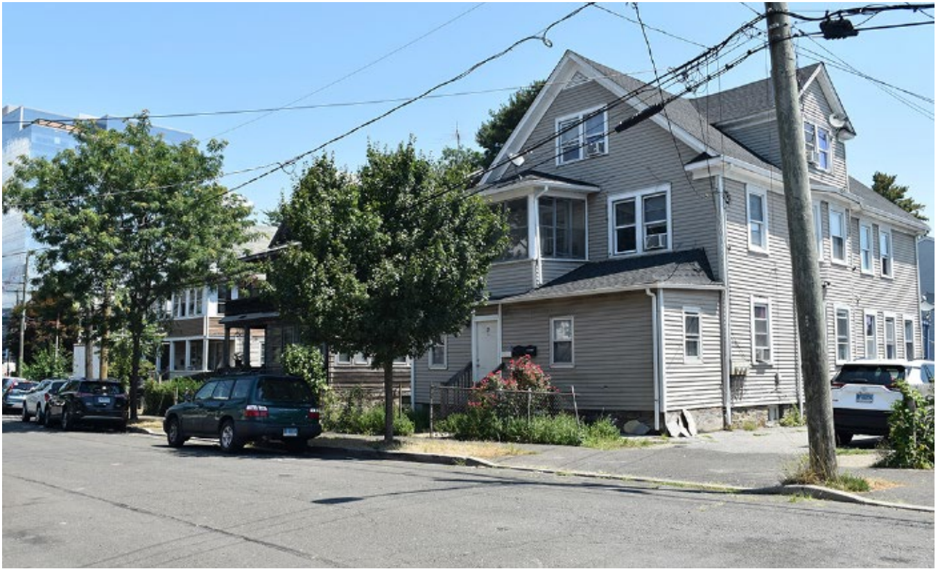
Photograph 32 Streetscape, multifamily houses on the eastern side of Berkeley