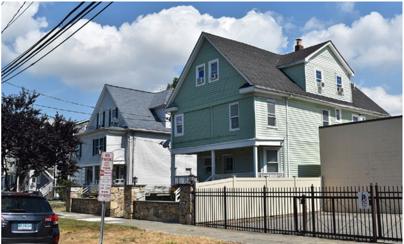
Photograph 49 Streetscape, multi-family houses on the northern side of Woodland Place, view northwest.