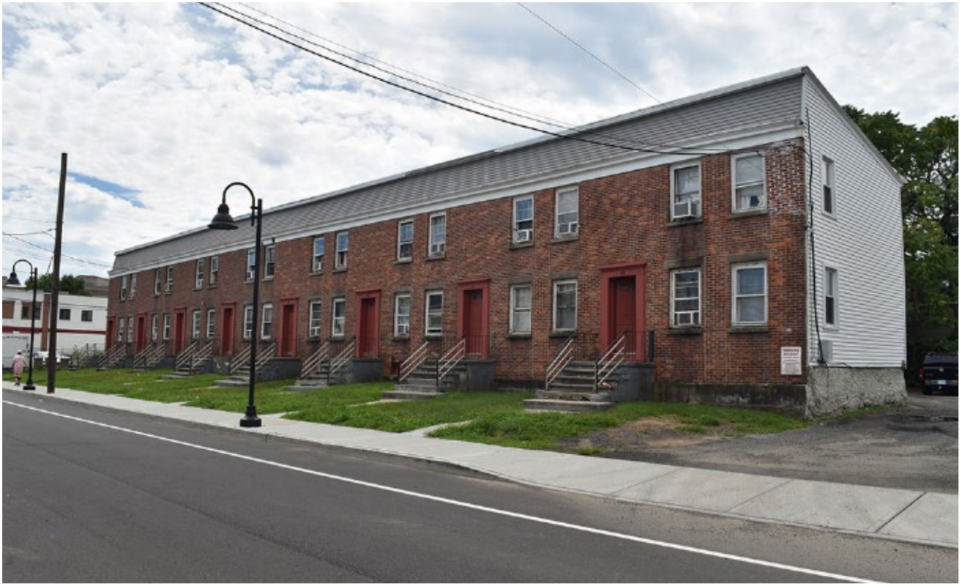
Photograph 14 Row houses (number 119) situated on the south side of Ludlow Street, view southeast.