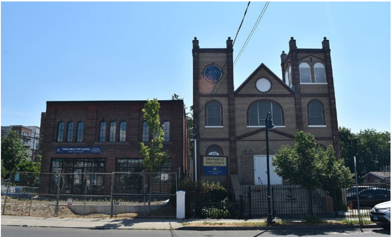
Photograph 2 648-670 Pacific Street. Engine & Hose Co. #2 (left) and Tabernacle of Grace Church (right).