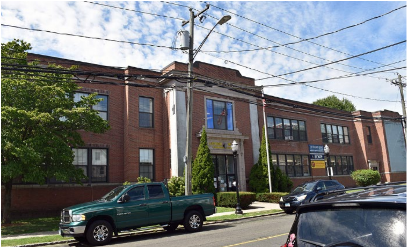
Photograph 1 The Lathon Wider Community Center, formerly the Woodland Avenue School.