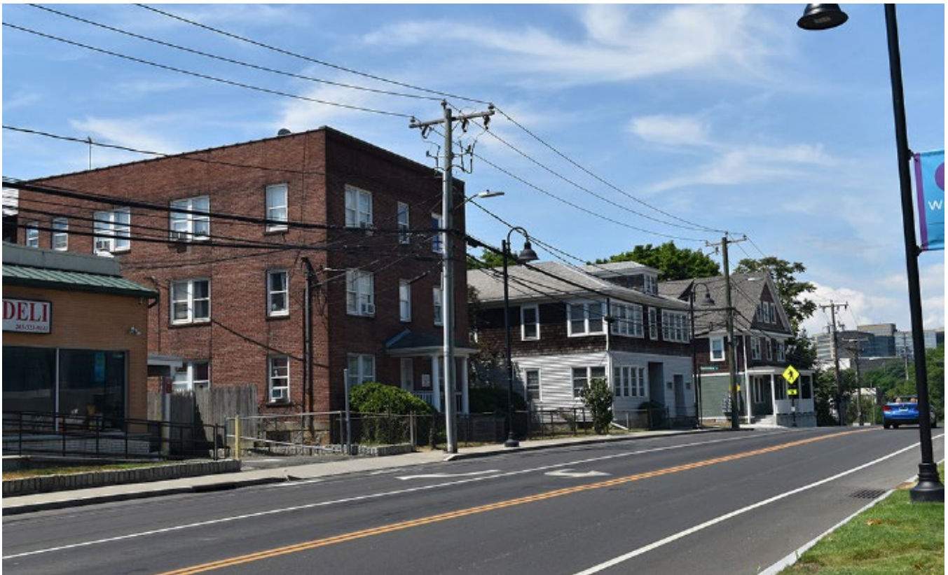
Photograph 33 Streetscape, Pulaski Street, view west.