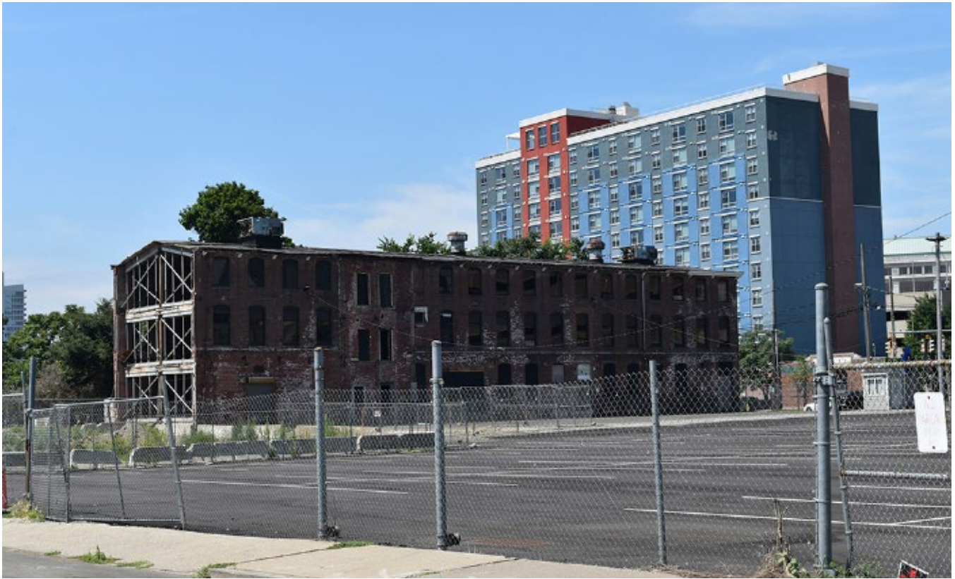
Photograph 26 The Blickensderfer Typewriter Factory, view southwest from Garden Street.