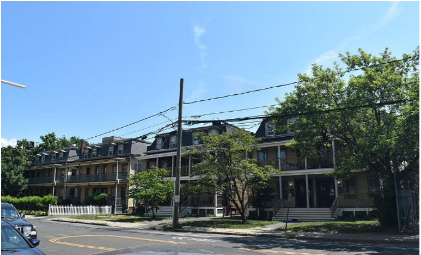
Photograph 36 Second Empire, multi-family houses on Atlantic Street, next to the Blickensderfer Factory, view northeast.