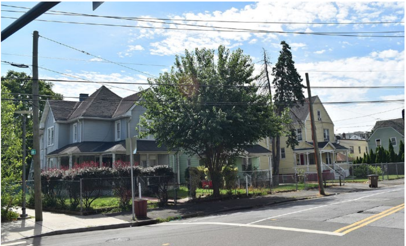
Photograph 37 Streetscape, eastern side of Atlantic Street (number 748-756), view southeast.