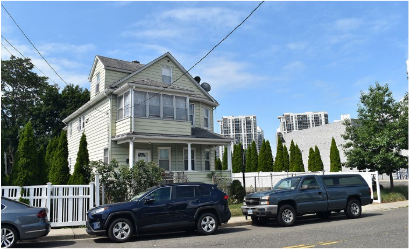
Photograph 54 29 Remington Street, view southwest.