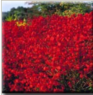
Winged Euonymus or Burning Bush Euonymus alatus