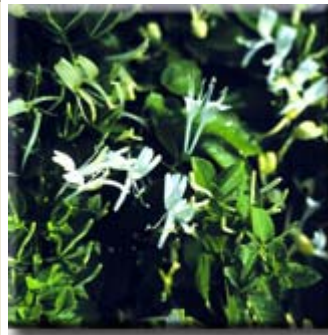
Japanese Honeysuckle Lonicera japonica