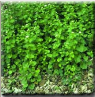
Garlic Mustard Alliaria petiolata