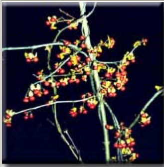
Asiatic Bittersweet Celastrus orbiculatus