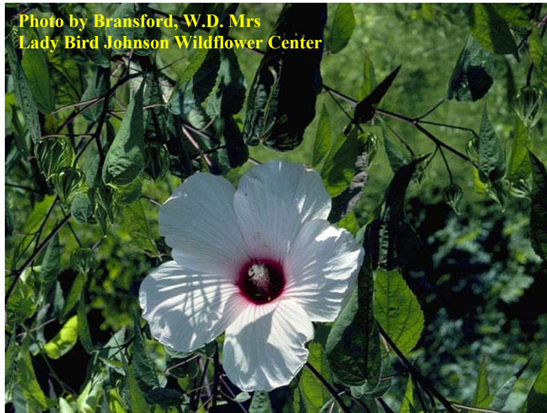
Mrs Lady Bird Johnson Wildflower Center