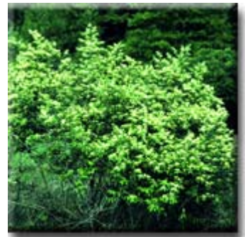
Morrow's Honeysuckle Lonicera morrowii