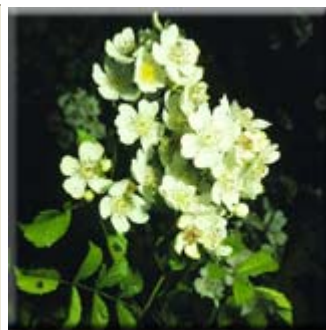
Multiflora Rose Rosa multiflora