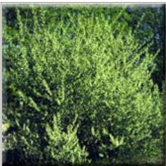
Autumn Olive Elaeagnus umbellata

In Connecticut, the Connecticut Invasive Plants Council has developed a list of non-native plants that cause (or have the potential to cause) environmental harm in minimally-managed areas. The most common known invasive plants are shown in the table below (see link to website for complete list).