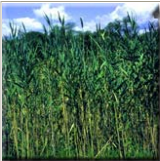
Common Reed Phragmites australis