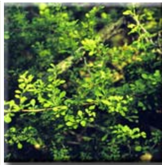
Japanese Barberry Barberis thunbergii