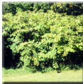
Japanese Knotweed Polygonum cuspidatum or Fallopia japonica