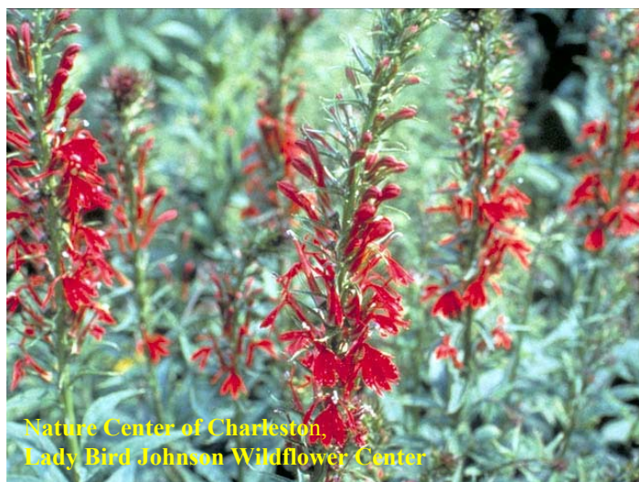
Nature Center of Charleston, Lady Bird Johnson Wildflower Center

A clump-forming iris that is native to marshes, swamps, wet meadows, ditches and shorelines. Grows in medium to wet soils in full sun to part shade. May be grown in up to 2-4" of shallow standing water (muddy bottom or containers), or in moist shoreline soils or in constantly moist humusy soils. Propagate by division after bloom. Wear gloves when dividing the rhizomes. After fall frost, plant leaves may be trimmed back to about 1" above the crown.