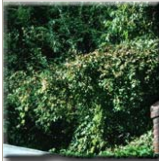
Porcelain Berry Ampelopsis brevipedunculata