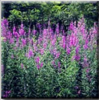
Purple Loosestrife Lythrum salicaria