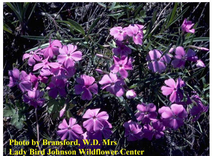
Lady Bird Johnson Wildflower Center

Creeping phlox is a mat-forming perennial with loose mats of semi-evergreen foliage and erect clusters of large flowers. The showy blossoms are lavender, blue or white with an eye of purple-red tinged in white. The leaves of this 6-10 in. plant are round or spoon-shaped.