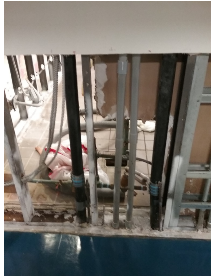
Mold on wall removed Cafeteria Side