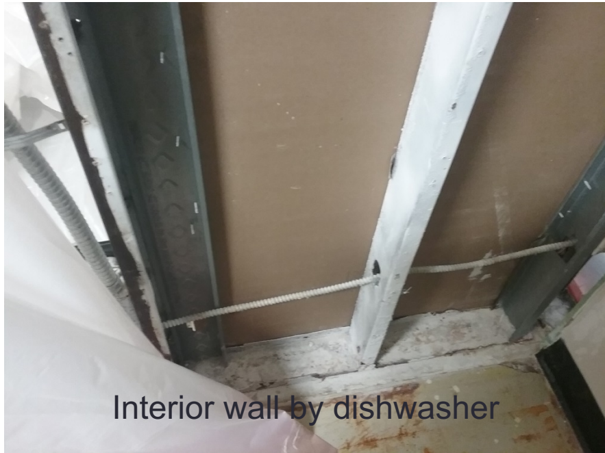
Interior wall by dishwasher