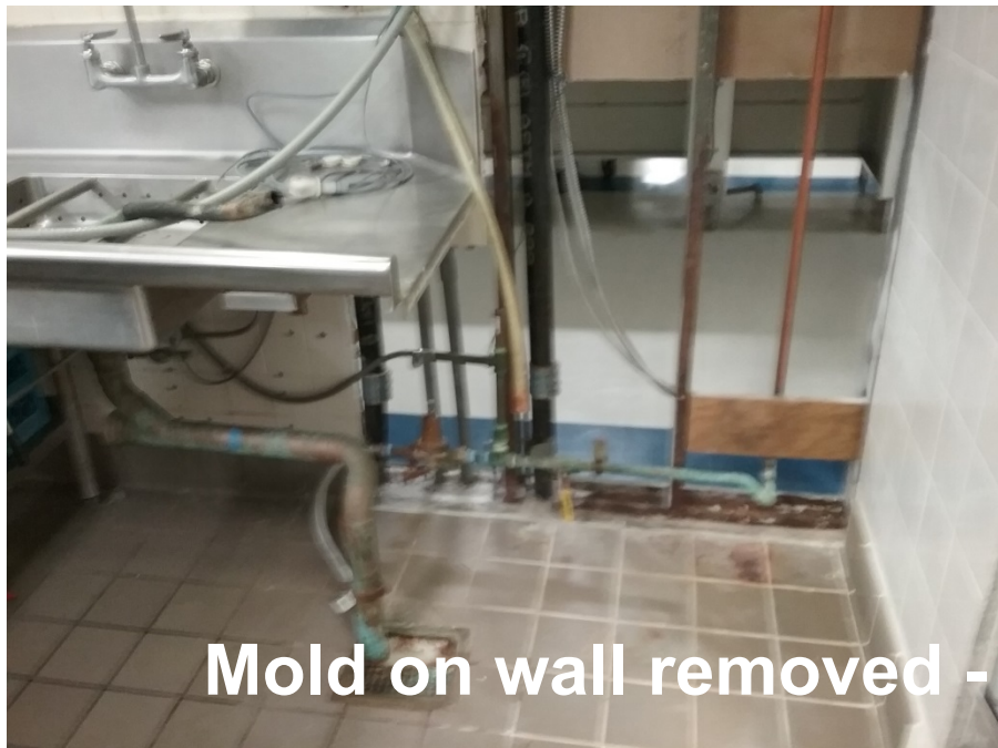
Mold on wall removed - Kitchen Side