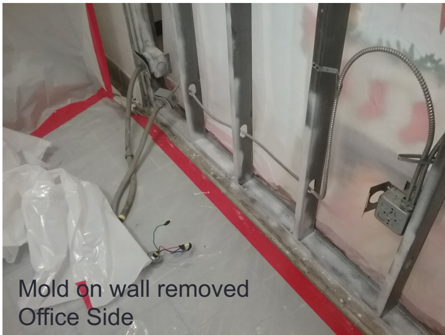
Mold on wall removed Office Side