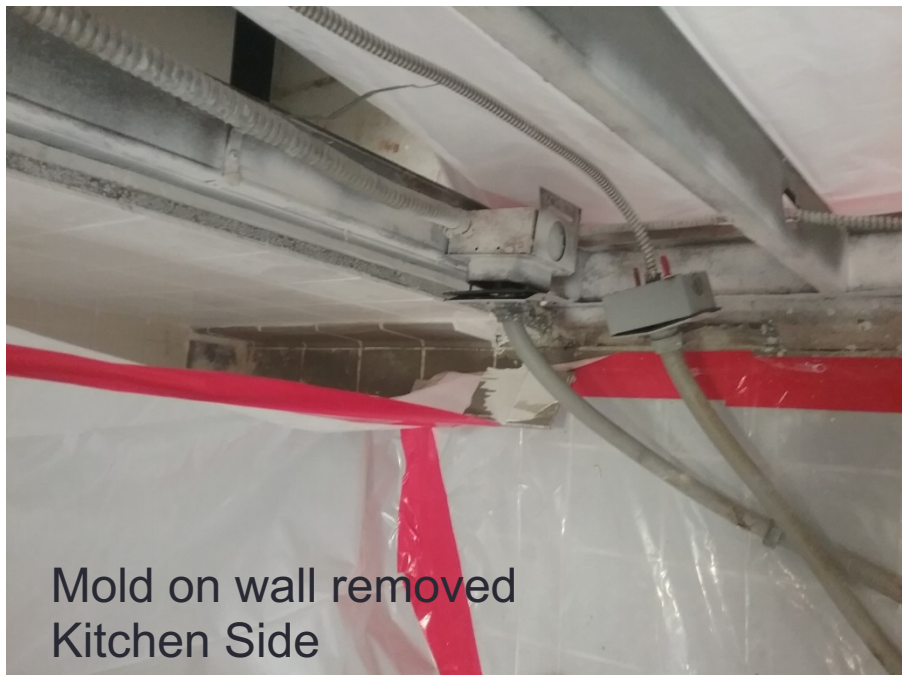
Mold on wall removed Kitchen Side