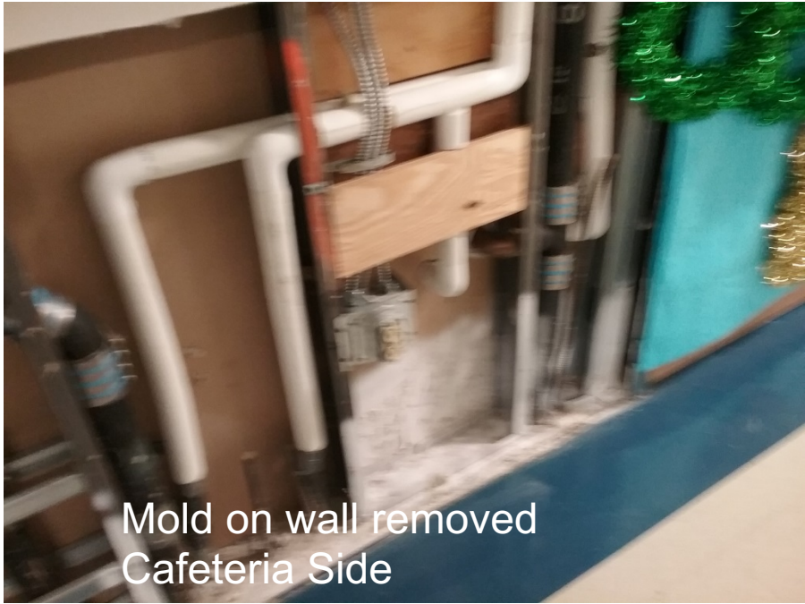
Mold on wall removed Cafeteria Side