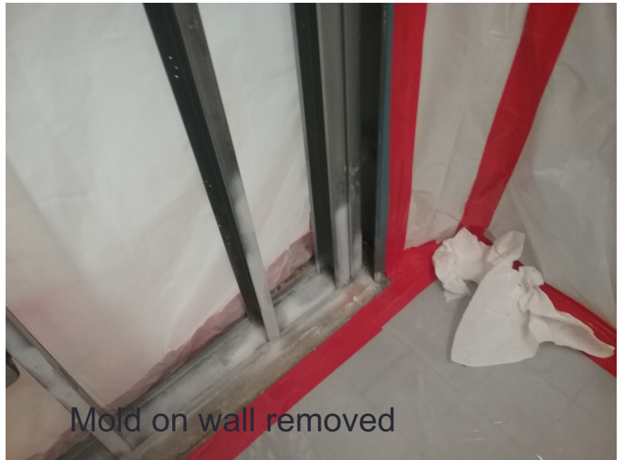
Mold on wall removed